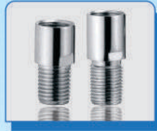
Extension Nipple Heavy - L & K (One Pcs Packing)