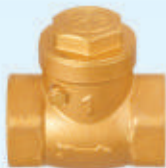
Forging Brass NRV (Check Valve) Horizontal - Hy