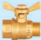
Forging Brass Butterfly B.V