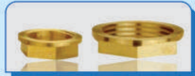
Brass Cheek Nut