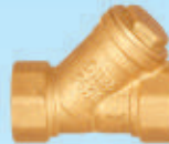
Forging Brass NRV & Y Strainer