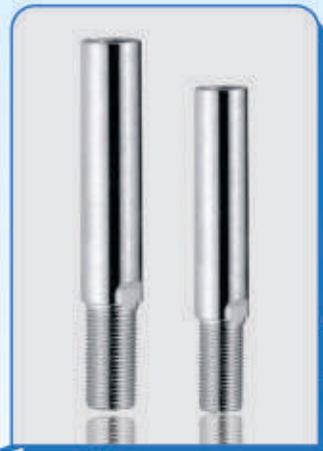
Extension Nipple 3/8"