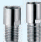
Sanitary Fitting & Accessories