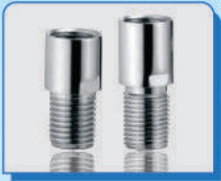
Extension Nipple Medium - L & K