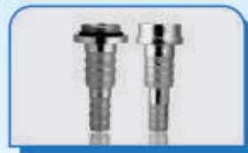
C.P. Hose Coller Fore Foam Flow Taps