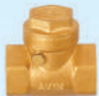
Forging Brass NRV (Check Valve) Horizontal