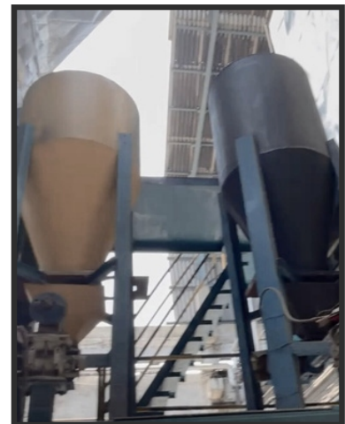
PAC & Lime Dosing

Our innovative designs optimize fuel consumption and minimize energy waste, to reduce the cost of steam and have substantial saving over long run.