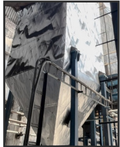
Drop Outlet Chamber