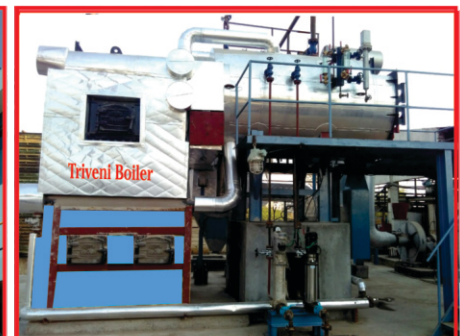
FBC / BBC