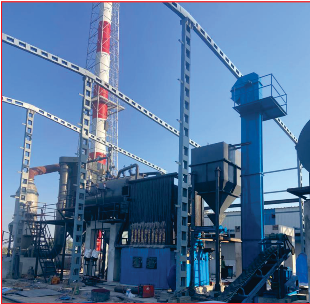
Water Cum Smoke Tube Boiler

Specilised in : Waste To Energy Plastic Fire Steam Boiler