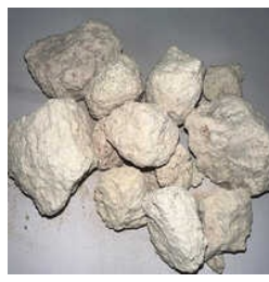
Crude China Clay Lumps