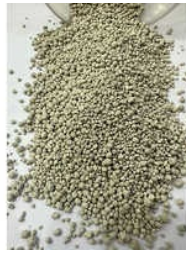
White Cat Litter Granules