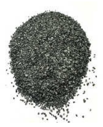
Black Activated Carbon Granule