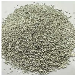
Premium Cat Litter Granules