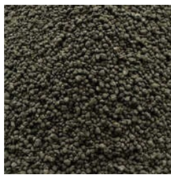
Leo Zeo Organic Soil Enhancer