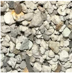
Organic Soil Conditioner