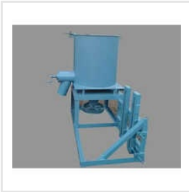
Plastic Heating Mixing Machine