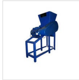
Metal Shredder Stone Crusher Machine