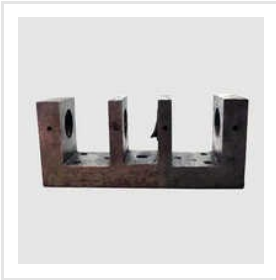
Crusher MS Toggle Block Lock Bar