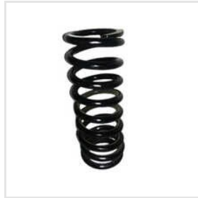
Stone Crusher Springs