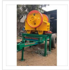
Portable Stone Crusher