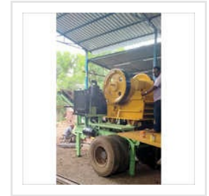
Industrial Stone Crusher