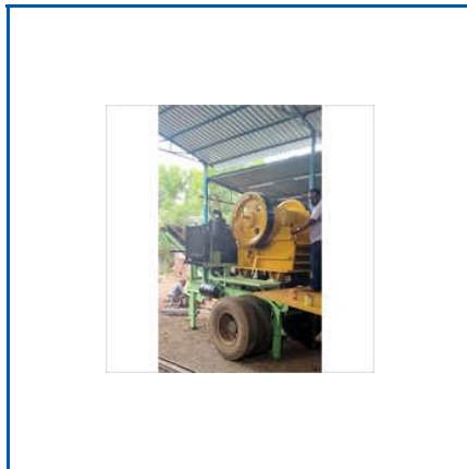
INDUSTRIAL STONE CRUSHER