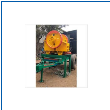
PORTABLE STONE CRUSHER