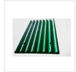
Crusher Jaw Plate