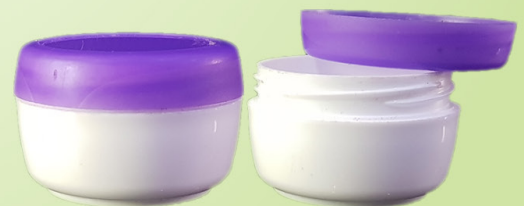
[ 10 ml ] (BP-10)