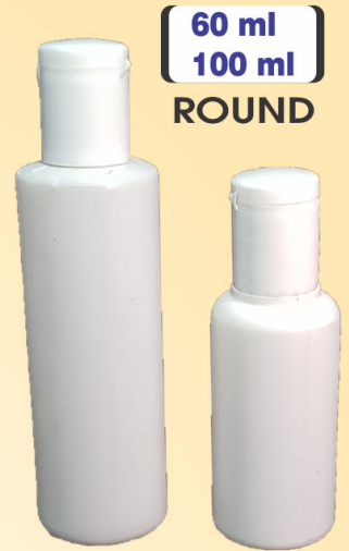
60 ml 100 ml ROUND