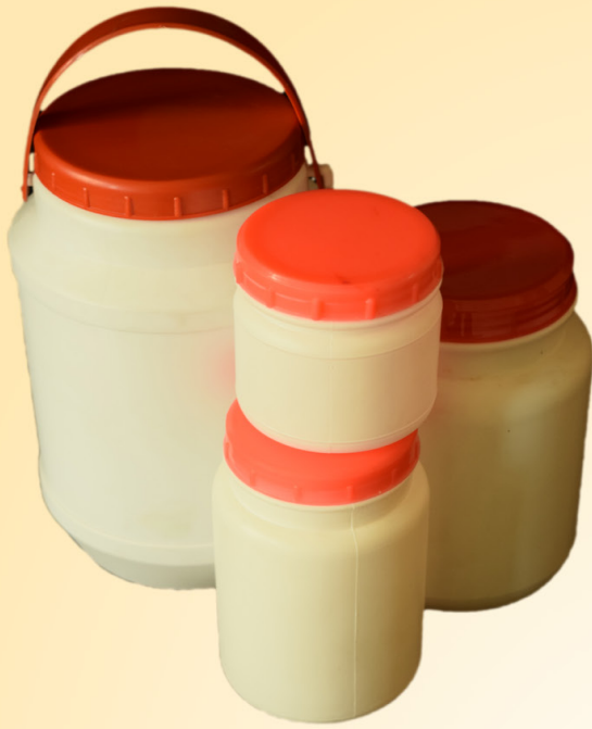
GHEE JAR 200ml 500ml 1000ml 2000ml