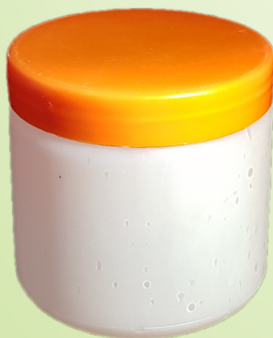
[ 250 ml ] (HS250)