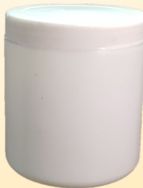
[ 500 gm ] (J6)