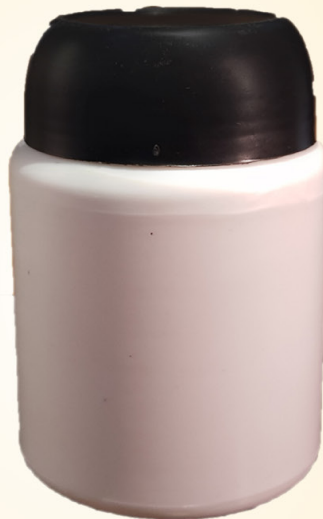
[ 400gm ] (PP400)T