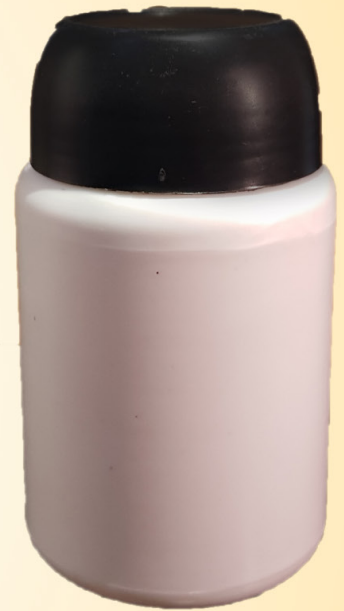
[ 600gm ] (PP600)