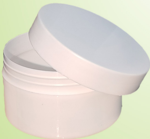
[ 200 ml ] SUPER