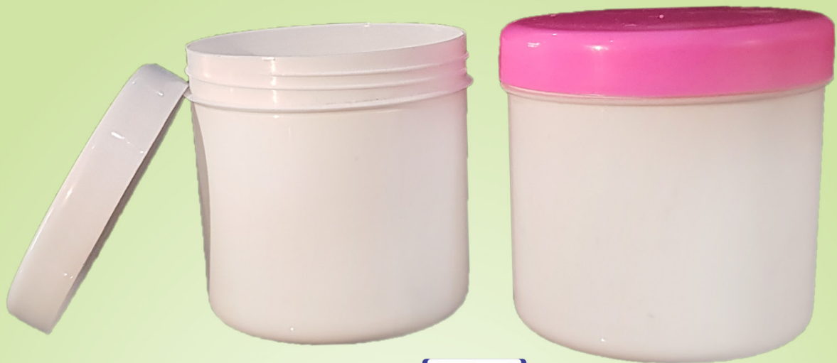
[ 600 ml ] JAR