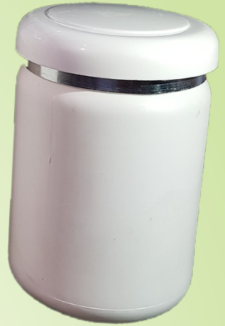
[ 400 ml ] MICRA JAR