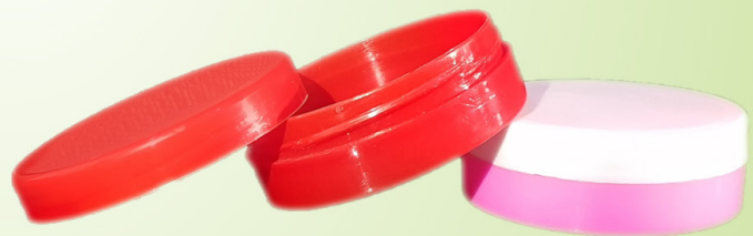
[ 20 ml ] (NPR)