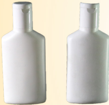
[ 60 ml ] FLAT