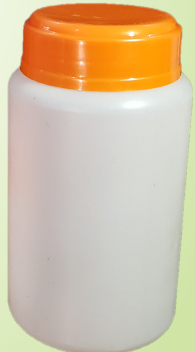
[ 800 ml ] (HS800)