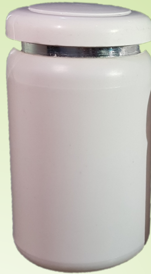
[ 600 ml ] MICRA JAR