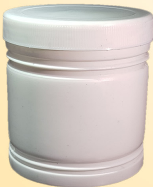
[ 500 gm ] RING JAR