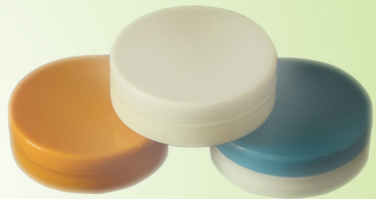
[ 25 gm ] (A25)