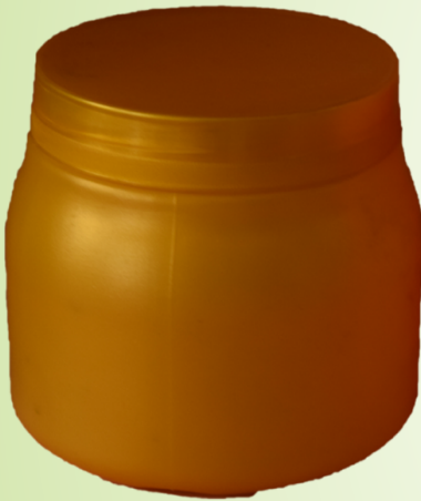
[ 500 gm ] (HS500)