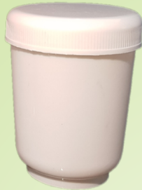
[ 100 ml ] (OG 100)