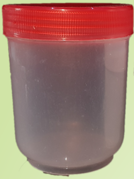
[ 200 ml ] (OG 200)