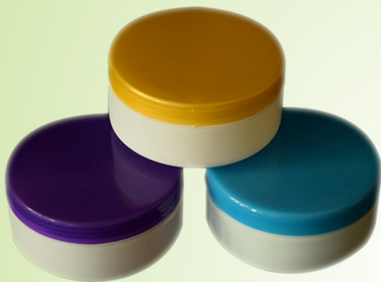
[ 80 gm ] (A80)