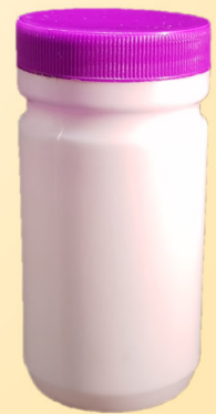
[ 100 gm ] CHURAN