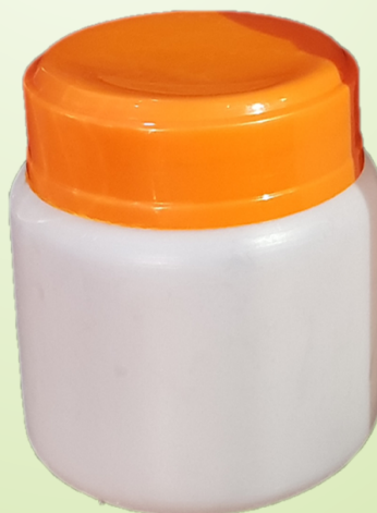
[ 400 ml ] (HS400)