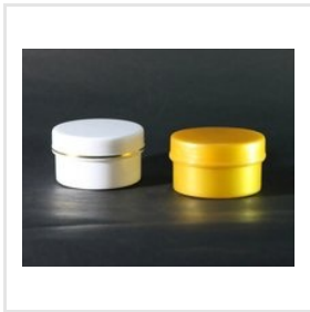
50 Gm Body Shape Jar