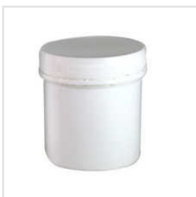
HDPE Plastic Container