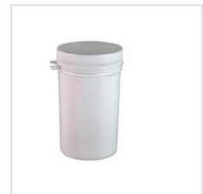
HDPE Wide Mouth Container