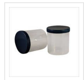
HDPE Capsules Bottle