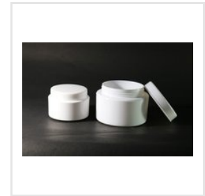
100 GM Double Wall Jar