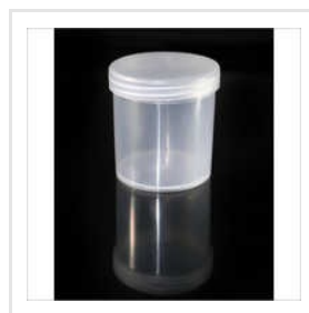
Plastic Pharmaceutical Jar 10NZ