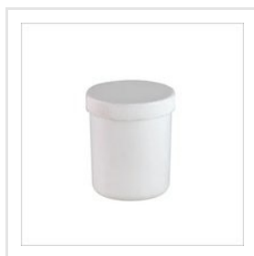
K.9.S Plastic Containers