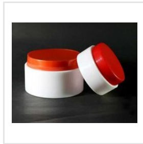
250 GM Double Wall Jar