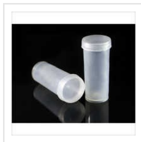
10 GM HING JAR