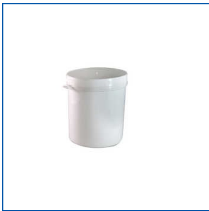
HDPE LEAK PROOF CONTAINER

10 gm Hing Jar, 10 gm Heeng Jar (1.onz), 10 gm Mdh Jar, 10 MI Urine Containers, 100 gm Double Wall Jar, 100 gm Hing Jar, 100 gm Old Gold Containers, 15 gm Double Wall Jar, 15 Gm Lip Balm Containers, 20 MI Pocket Perfume Bottle, 200 gm Cream Container, 200 gm J Old Jar, 200 gm Pet Jar, 250 gm Double Wall Jar, 28 Mm Flip Top Cap, Etc.