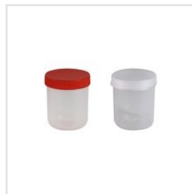
10 ML URINE CONTAINERS