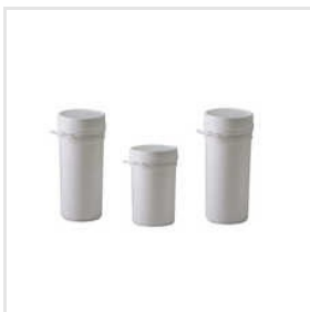
HDPE Cylindrical Container