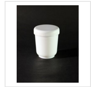
100 Gm Old Gold Containers