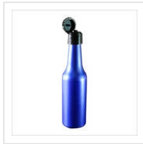
Plastic Body Lotion Containers