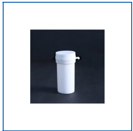
AIR TIGHT PLASTIC CAPSULE JAR