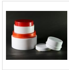
80 Gm Body Shape Jar