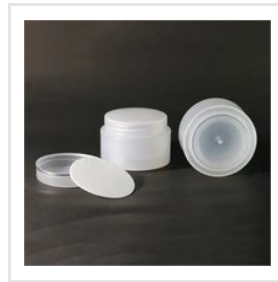
50 Gm Double Wall Jar