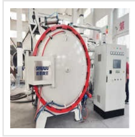
Vacuum Annealing Furnace