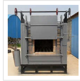
Heat Treatment Furnaces