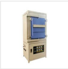
Inert Atmosphere Furnace