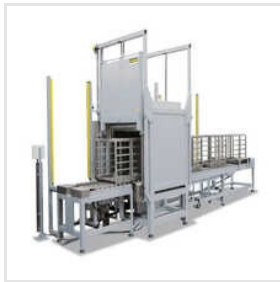
Continuous Mesh Belt Furnace