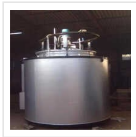
Pit Type Tempering Furnace