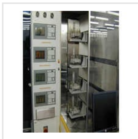
Nitrogen Purging Furnace