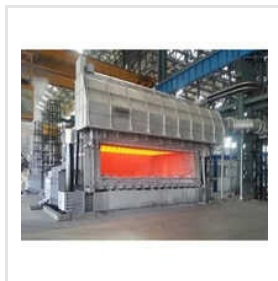
Aluminum Melting Furnace