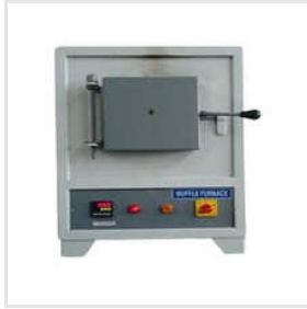
High Temperature Muffle Furnace