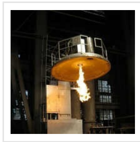
Vertical Ladle Preheater