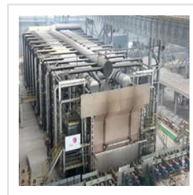
Walking Beam Furnaces