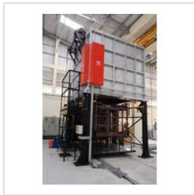
Drop Bottom Quench Furnace