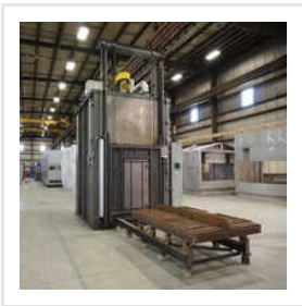
Aluminium Solution Annealing Furnace