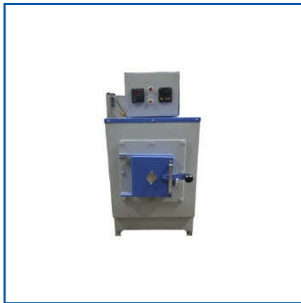
HIGH TEMPERATURE MUFFLE FURNACE