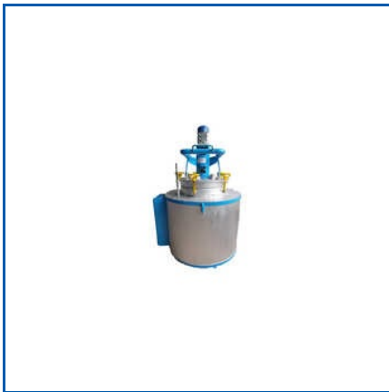
GAS CARBURIZING FURNACE

42KW Electric Industrial Oven, Aluminium Solution Annealing Furnace, Aluminum Melting Furnace, Annealing Furnaces, Carburizing Furnace, Commercial Furnace Calibration Services, Commercial Hardening And Tempering Service, Continuous Mesh Belt Furnace, etc.