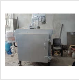
Electric Melting Furnace