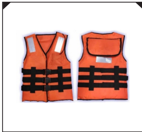
Life Jacket - Model Mi300