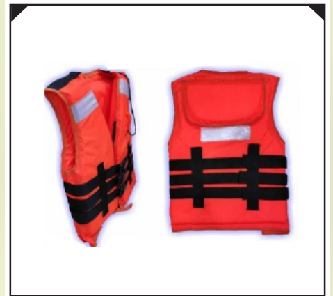
Life jacket - Model Mi400