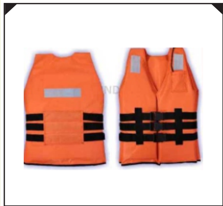
Life Jacket - Model Mi200