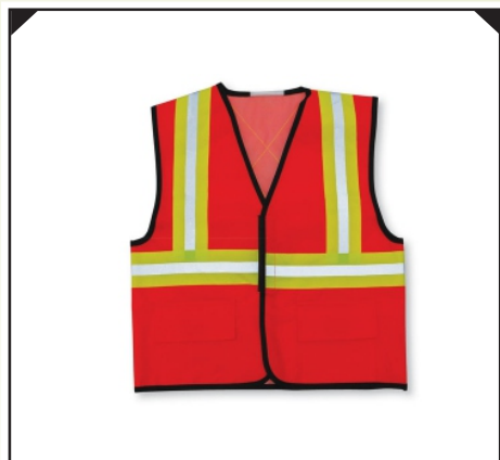
Traffic Safety Vest