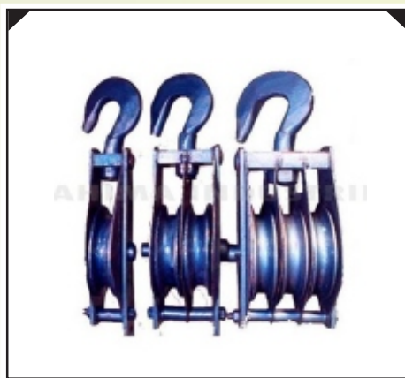
Manila Rope Pulley Block