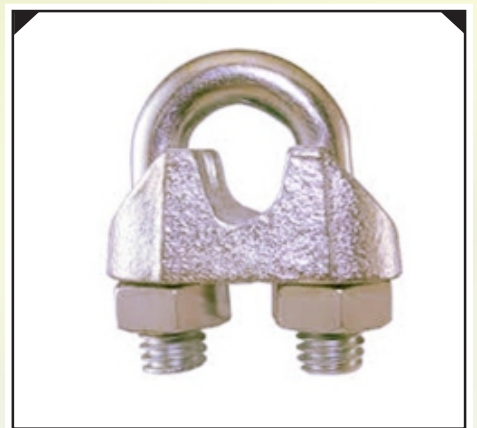
Wire Rope Clamp