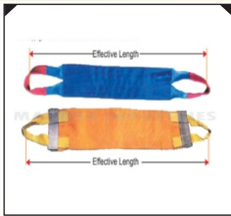
Polyester Bag Slings