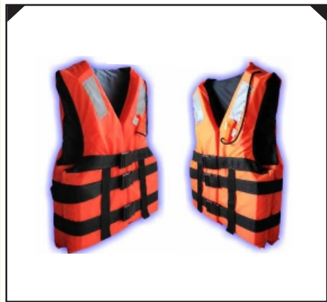
CE And ISO Approved Life Jacket - Mi500