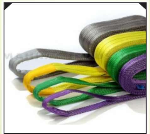
Polyester Webbing Slings