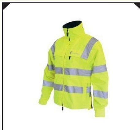
Reflective Safety Jacket For Traffic