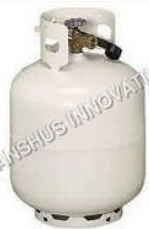
Industrial Propane Gas