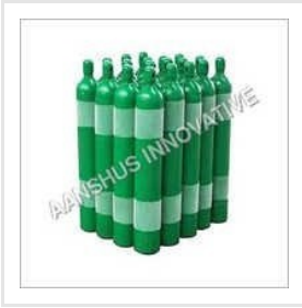
UHP Grade Industrial Gases