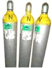
Hydrogen Chloride Gas