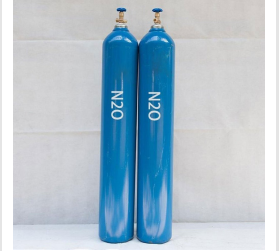
Nitric Oxide Gas