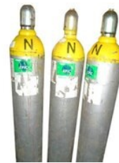
HYDROGEN CHLORIDE GAS