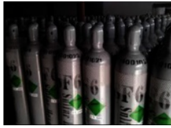
Sulfur Hexafluoride Gas