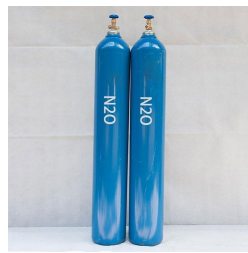
NITRIC OXIDE GAS