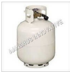
INDUSTRIAL PROPANE GAS

Argon Gas, Deuterium Gases, Diborane Gas, Gaseous Helium, Helium Gas, Hydrogen Chloride Gas, Industrial Propane Gas, Laser Gas Mixtures, Liquid Helium, Nitric Oxide Gas, Refrigerant R134a, SF6 Gas, Silane Gas, Sulfur Hexafluoride Gas, UHP Grade Industrial Gases, etc.