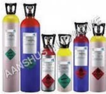
Laser Gas Mixtures