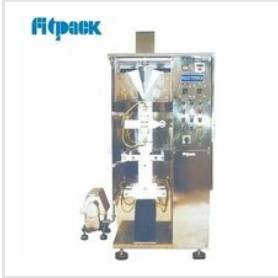
Oil Pouch Packing Machine