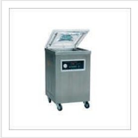
Deep Chamber Vacuum Packing