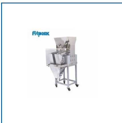
SUGAR PACKING MACHINE

Auger Filler, Bag Closer Machine, Continuous Pouch Sealer, Conveyor Shrink Packing Machine, FFS Collar Type With Auger Filler, FFS With Auger Filler, Industrial Threads, L Sealer with Shrink Tunnel, Overlock Machine, Picot Hemstitch Machine, Semi Automatic Box Strapping Machine, Single Chamber Vacuum Packing Machine, Single Needle Lockstitch Machine, Steam Press, Zigzag Machine, etc.