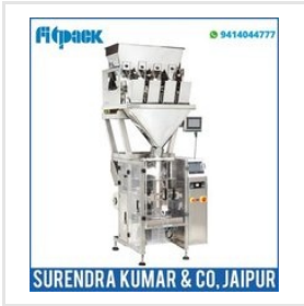
Industrial Pouch Packing Machine