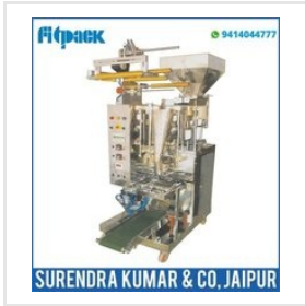
Pneumatic Automatic Pouch Packing