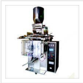
Multi Track Packaging Machine