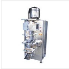
Water Pouch Packing Machine