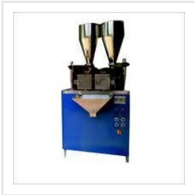
Weigh Filler Machine