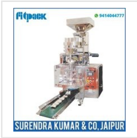
Automatic Pouch Packing Machine