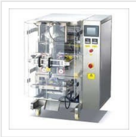
Automatic Pouch Packing Machine