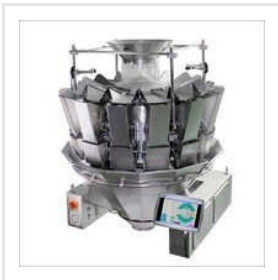
Multihead Combination Weigher