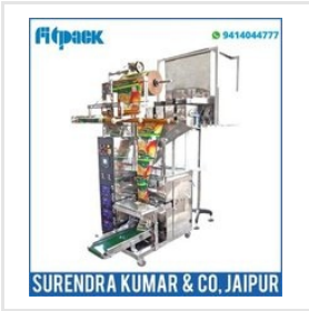
4 Head Weigher Automatic Pouch