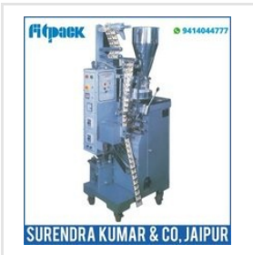
Electric Pouch Packing Machine