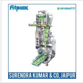
Industrial Automatic Pouch Packing