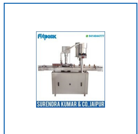
AUTOMATIC BOTTLE CAPPING MACHINE