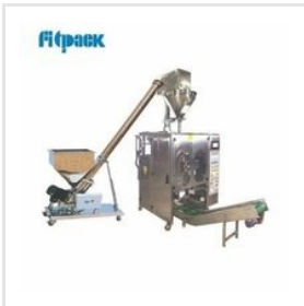
Wheat Flour Packing Machine