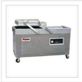
Vacuum Packing Machine