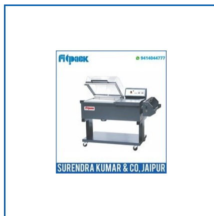
2-IN-1 CHAMBER SHRINK PACKING MACHINE