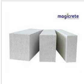
Magcrete AAC Blocks