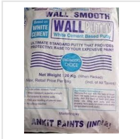
White Cement Wall Putty