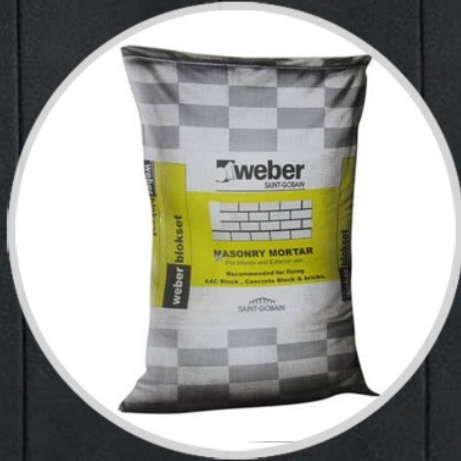
Self Curing Adhesives