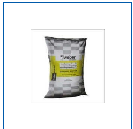
INTERIOR AND EXTERIOR MORTAR