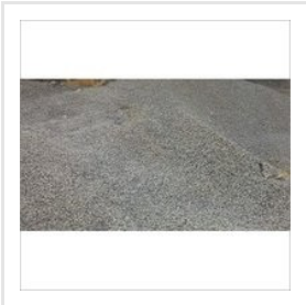
Construction Stone Grit