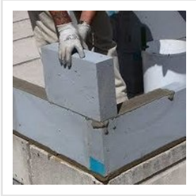
AAC Fix Blocks