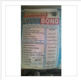
Construction Block Jointing Adhesive