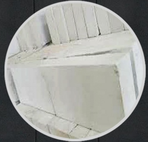
Autoclaved Aerated Concrete Rubbles

3 Inch AAC Blocks, 4 Inch AAC Blocks, 6 Inch AAC Blocks, 8 Inch AAC Blocks, AAC Block Adhesive, AAC Broken Block, AAC Building Block, AAC Construction Blocks, AAC Ecolite Blocks, AAC Fix Blocks, AAC Fly Ash Block, AAC Hollow Concrete Blocks, AAC Light Weight Block, AAC Light Weight Blocks, AAC Rubble Blocks, etc.