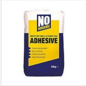
Wall And Floor Adhesive