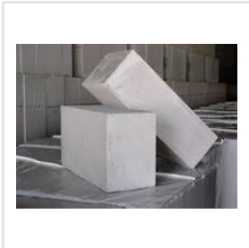
Aerocon AAC Blocks