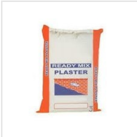
Construction Ready Mix Plaster