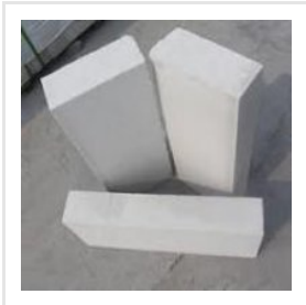
Construction Autoclaved Aerated