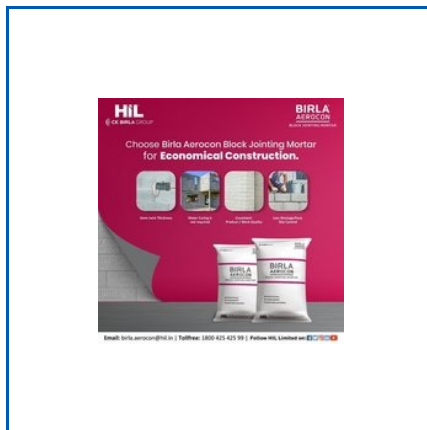
BLOCK JOINTING MORTAR