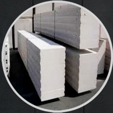
Autoclaved Aerated Concrete Block