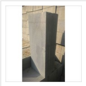
6 Inch AAC Blocks