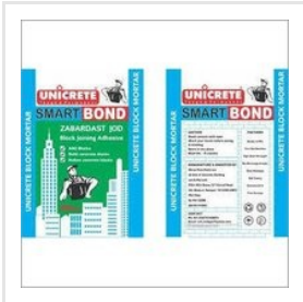
Block Bonding Adhesive