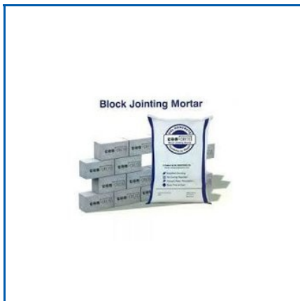
CONSTRUCTION BLOCK JOINTING MORTAR

3 Inch AAC Blocks, 4 Inch AAC Blocks, 6 Inch AAC Blocks, 8 Inch AAC Blocks, AAC Block Adhesive, AAC Broken Block, AAC Building Block, AAC Construction Blocks, AAC Ecolite Blocks, AAC Fix Blocks, AAC Fly Ash Block, AAC Hollow Concrete Blocks, AAC Light Weight Block, AAC Light Weight Blocks, AAC Rubble Blocks, etc.