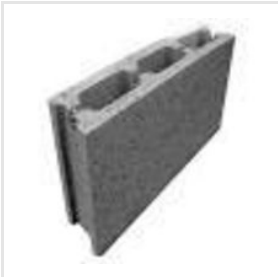
Building Hollow Blocks