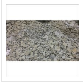
Construction AAC Broken Blocks