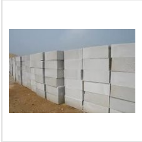
AAC Wall Blocks