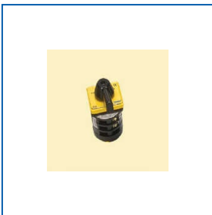
10A MOTOR SWITCH

01-0AC3 Push Button Station, 10A Motor Switch, 32A Control Switch, 4 Way Push Button Station, 75A Motor Switch, AC Snap Action Limit Switch, Black Projecting Button, Blue Pilot Light, Cam Operated Rotary Switch, Cast Aluminium Push Button Station With Ammeter, Clip On Type Junction Box, Double Throw Change Over Switch, Electrical Junction Box, FRP Enclosure Push Button Station, Flameproof Junction Box, etc.