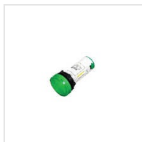
Green Led Barrel Indicating Light