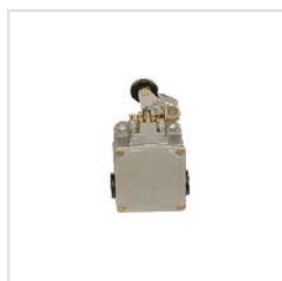
Limit Switch For Machine Tools