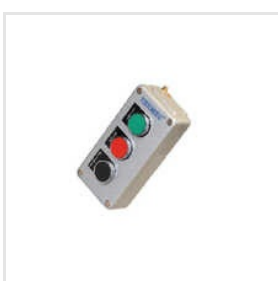
01-0AC3 Push Button Station