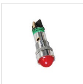
Red LED Indicator Light