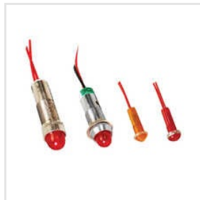
Red Panel Mount Indicator Light