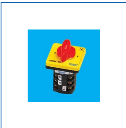
CAM OPERATED ROTARY SWITCH