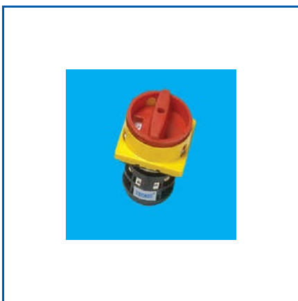
TEKMEC UNIQUE ROTARY CAM SWITCH