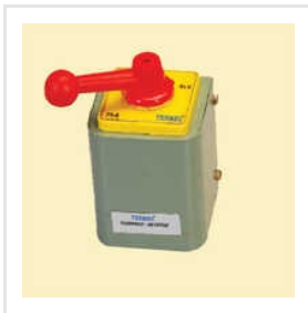
75A Motor Switch