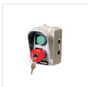
Tekmec Weatherproof Push Button Station