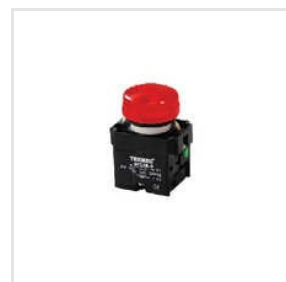
Red Led Standard Indicating Light