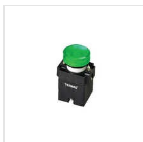
Green Led Multi Voltage Indicating