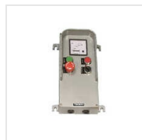
Cast Aluminium Push Button Station With