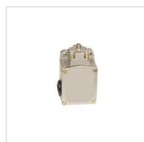
Metal Limit Switch