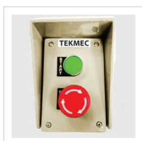
FRP Enclosure Push Button Station