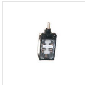
AC Snap Action Limit Switch