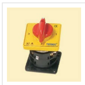
32A Control Switch