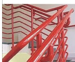
Mild Steel Railing