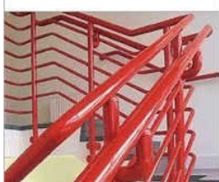
Mild Steel Hand Railing