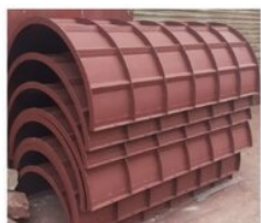
Square And Rectangular Column