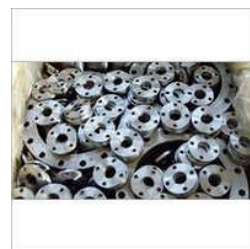
Mild Steel Flanges