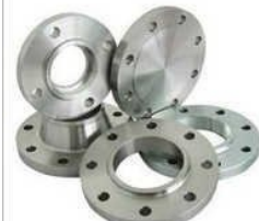
Stainless Steel Flanges