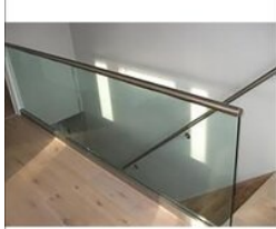
Stair Hand Railings