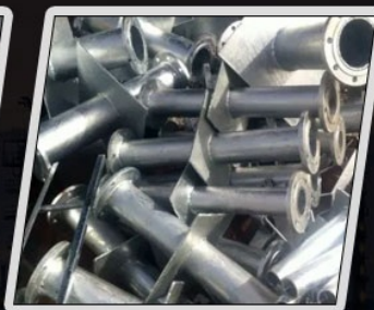
Mild Steel Hand Railing | Hy Rib Sheet | Hot Dipped Puddle Flanges

Aluminium Cable Tray, Aluminium Ceiling Works, Aluminium Partition Works, Column Formwork, Column shutter, Fencing Works, Fire Resistant Ceiling, Fire Resistant Partition, Flexseal Puddle Flanges, Galvanized Grating, Galvanized Steel Cable Tray, Gypsum Ceilings, Gypsum Partition, Hot Dip Galvanized Grating, Hot Dipped Puddle Flanges, etc.