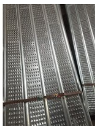
Hy Rib Sheet