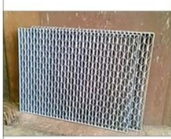
Mild Steel Grating