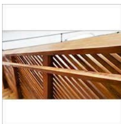
WOODEN HAND RAILING