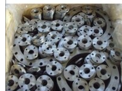
Mild Steel Flange