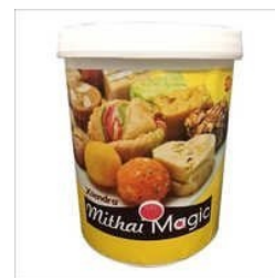
XTENDRA MITHAI MAGIC