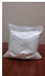
Vital Wheat Gluten