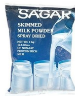
SKIMMED MILK POWDER