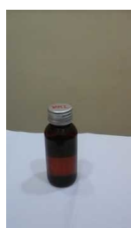
Food Flavour Additives