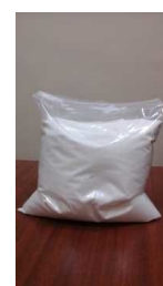
TBHQ Or Tertiary Butyl Hydro Quinone