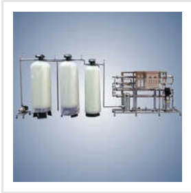
Industrial Water Softener And RO