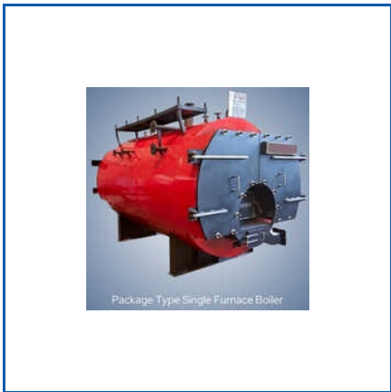
Package Type Single Furnace Boiler

Industrial Condensate Recovery System, Industrial Hot Air Generator, Industrial Water Softener And RO System, Non Vertical Boiler Holder, Package Type Single Furnace Boiler, Three Pass Oil Fired Thermic Fluid Heater, Three Pass Oil Gas Fired Hot Water Generator, etc.