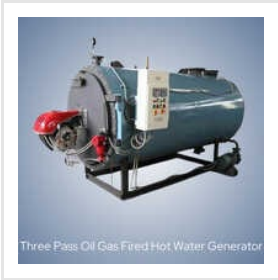
Three Pass Oil Gas Fired Hot Water Generator