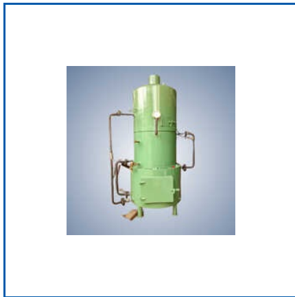
NON VERTICAL BOILER HOLDER