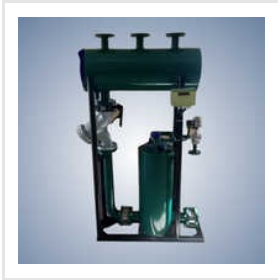
Industrial Condensate Recovery System