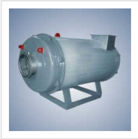
Industrial Hot Air Generator