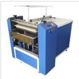
Hot And Cold Gluing Machine