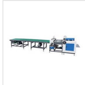
Fully Automatic Rigid Box Making Machine