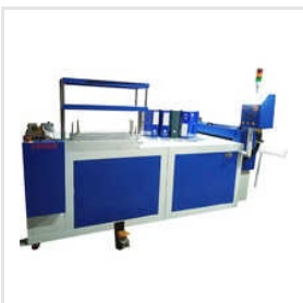
Jumbo Case Maker Machine