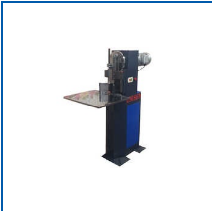
BOARD TO BOARD PASTING MACHINE