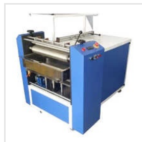
Paper Gluing Machine