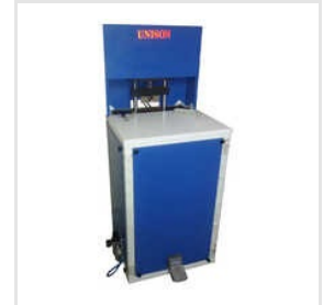
Corner Cutting Machine