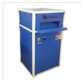
Unison Gluing Machine