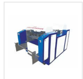
Mild Steel Paper Sheet Separator Machine