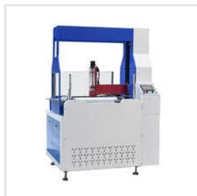
Rigid Box Making Machine