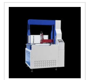
Rigid Box Wrapping Machine