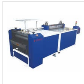
Automatic Case Maker Machine