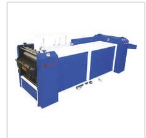
Semi Automatic Case Maker Machine