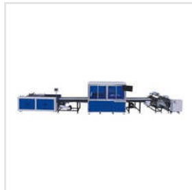
Fully Automatic Case Making With Four Side