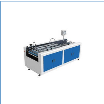
FOUR SIDE FOLDING MACHINE