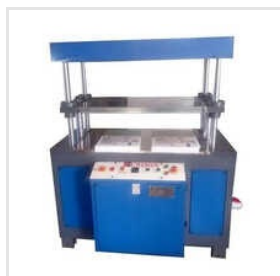
Hydraulic Dab Press Machine