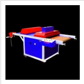
UV Dryer Machine