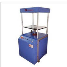
Hydraulic Single Side Book Pressing Machine