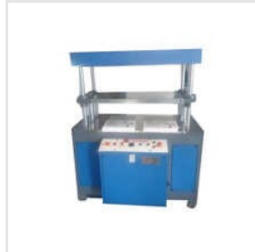
Hydraulic Twin Book Press Machine