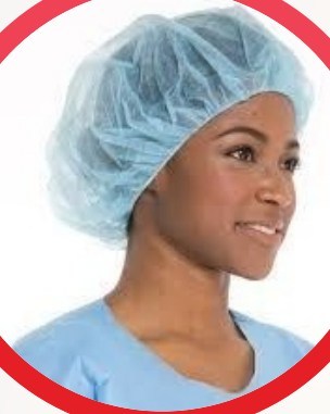
Non Woven Bouffant Cap