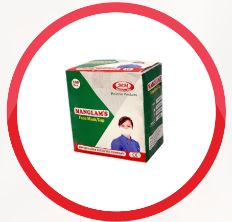
Manglam's Face Mask Cap