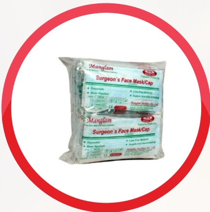
Sugeon's Face Mask Cap