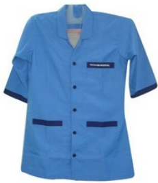
Para Medical Staff Dress