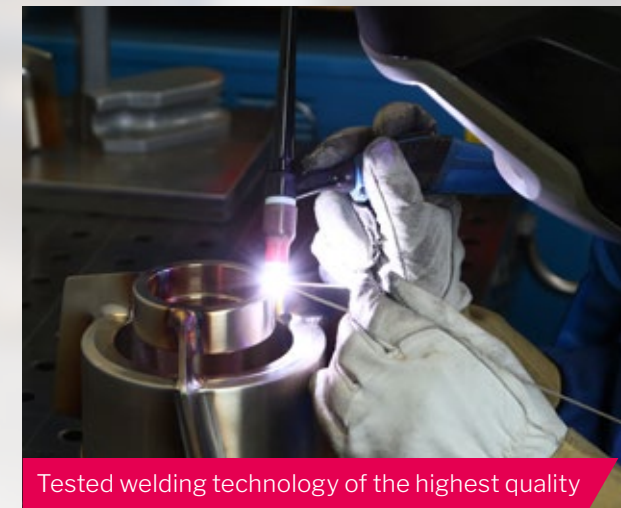
Tested welding technology of the highest quality

All the agitators we offer are freely configurable and are available for all commonly used assembly situations, which ensures seamless integration into your processes. We can also offer custom constructions designed for you by our own development department. Even though our agitators are incredibly diverse: They all feature excellent materials and production quality, meet the highest specifications for aseptic design and of course comply with internationally recognised industry standards such as the FDA and GMP.