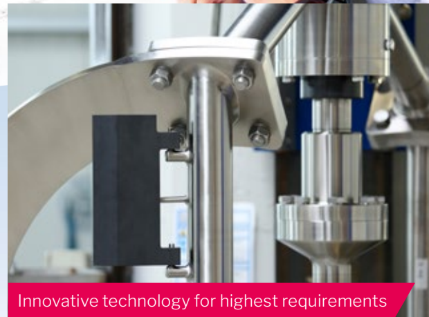
Innovative technology for highest requirements