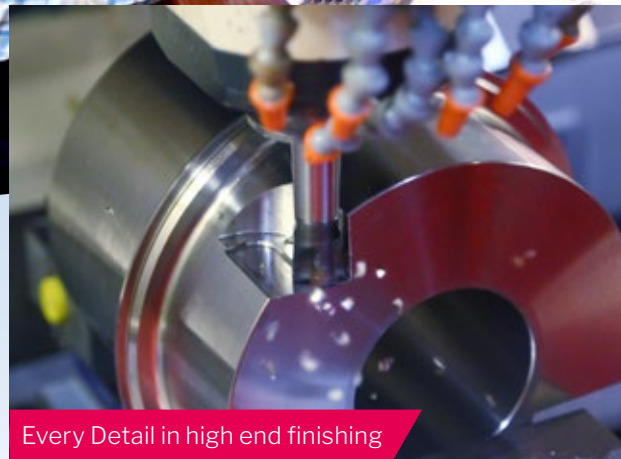
Every Detail in high end finishing