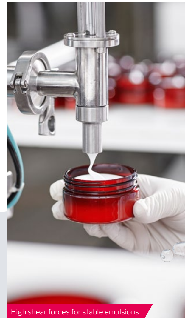
High shear forces for stable emulsions

Benefit from the numerous advantages of the tailor-made PRG agitators in the manufacturing of cosmetics. If you would like more detailed advice, we would be happy to talk to you in person!