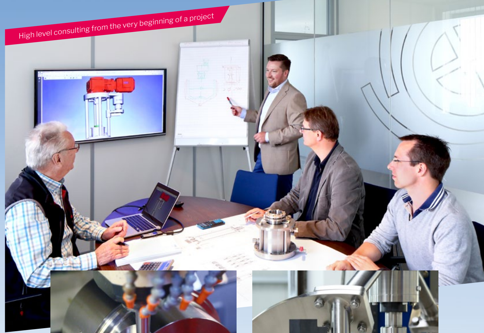
High level consulting from the very beginning of a project