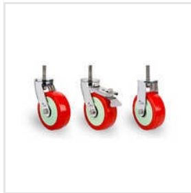
Heavy Duty Stud Type SS Fabricated Caster