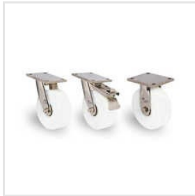
Medium Duty Plate Type SS Fabricated