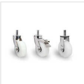
Heavy Duty Pin Type SS Fabricated Caster On