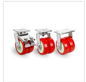
Twin Duty Plate Type SS Fabricated Caster