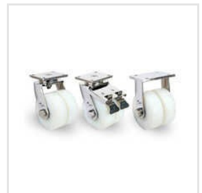
Twin Duty Plate Type SS Fabricated Caster