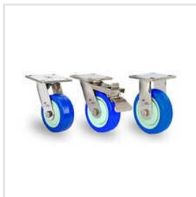
Medium Duty Plate Type SS Fabricated