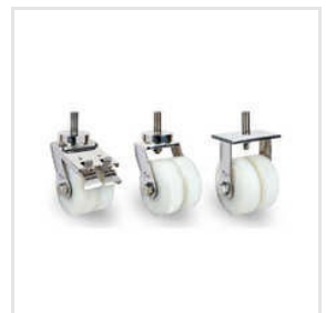
Twin Duty Stud Type SS Fabricated Caster On