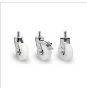
Medium Duty Pin Type SS Fabricated Caster