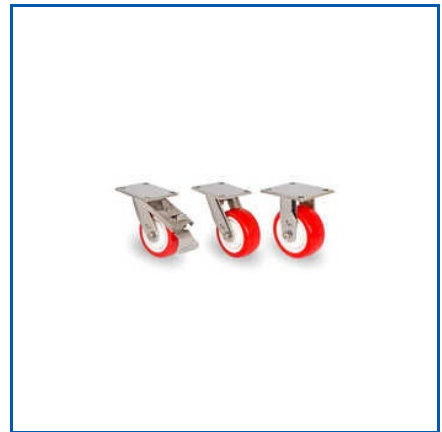
MEDIUM DUTY PLATE TYPE SS FABRICATED CASTER ON PU