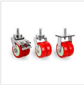
Twin Duty Pin Type SS Fabricated Caster On