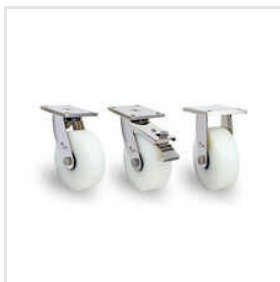
Heavy Duty Plate Type SS Fabricated Caster