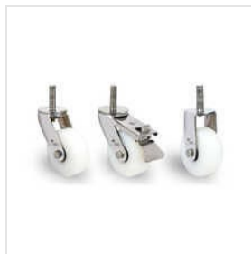
Medium Duty Stud Type SS Fabricated