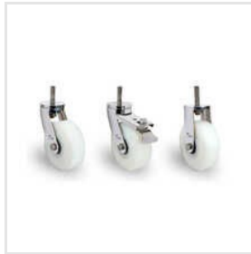
Heavy Duty Stud Type SS Fabricated Caster