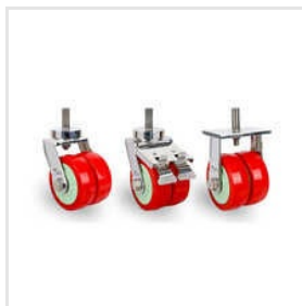
Twin Duty Stud Type SS Fabricated Caster On