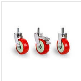
Heavy Duty Pin Type SS Fabricated Caster On