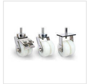
Twin Duty Pin Type SS Fabricated Caster On