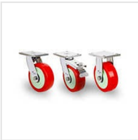
Heavy Duty Plate Type SS Fabricated Caster