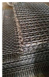
Screen Cloth Wire Mesh