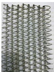
STEEL CONVEYOR WIRE

Black Vibrator Screen Rubber Beading, Chainlink Wire Mesh, EPDM Black Rubber Channel Profile, Industrial Chainlink Wire Mesh, Industrial Conveyor Wire, Industrial Refectories Wire Mesh, Industrial Screen Cloth Wire Mesh, Industrial Wire Net, Iron Crusher Vibrating Screen Bolt, Mild Steel Chainlink Wire Mesh, Refectories Wire Mesh, Screen Cloth Wire Mesh, Silica Screening Mesh, Stainless Steel Stone Crusher Screen Mesh, Steel Chainlink Wire Mesh, etc.