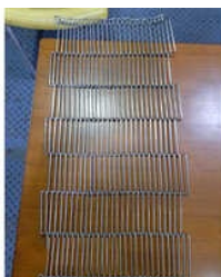
INDUSTRIAL CONVEYOR WIRE