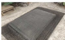
Steel Screen Cloth Wire Mesh