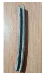
EPDM BLACK RUBBER CHANNEL PROFILE