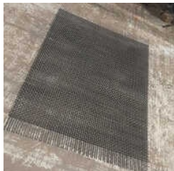
Industrial Screen Cloth Wire Mesh