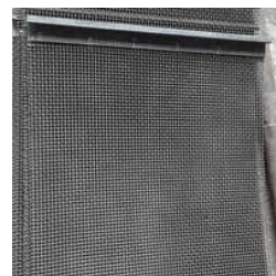
Industrial Refractories Wire Mesh