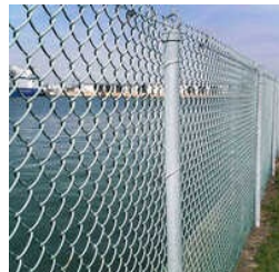
Industrial Chainlink Wire Mesh