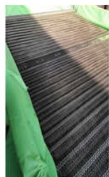
Industrial Refractories Wire Mesh