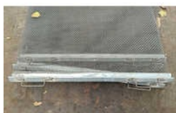
Stainless Steel Stone Crusher Screen Mesh