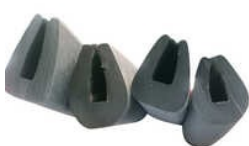
Black Vibrator Screen Rubber Beading