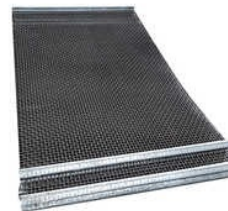
Vibrating Screen Mesh