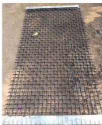
Vibrating Screen Mesh