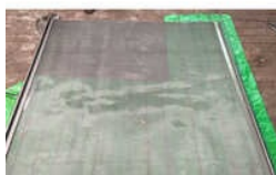
Silica Screening Mesh