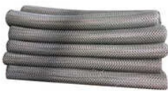
Mild Steel Chainlink Wire Mesh