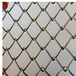
Chainlink Wire Mesh