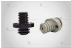
LOW VOLTAGE BUSHING

Alumina Filled Insulator, BIL Fuse Cut Out Insulator, Breaker Support Insulator , Distribution Class Surge Arresters, ESP Insulators, Electrical Bushing , Electrical Insulating Items, Electrical Insulators, Electrical LV Bushing, HV Bushing , High Voltage Insulator, Industrial BIL Fuse Cut Out Insulator, Insulating Base Surge Arrester, Insulators, LA Disconnectors, etc.