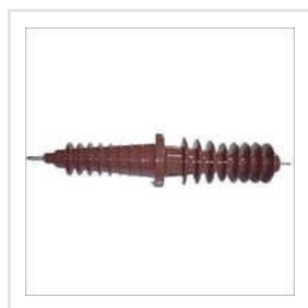
33kV Overhead Electrical Bushing