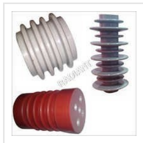
Stand Off Insulators