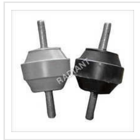
Surge Arresters Insulators