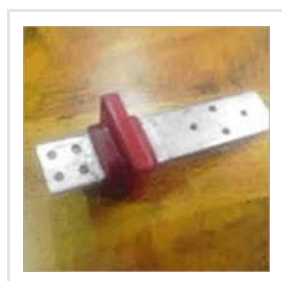
1500 AMP LV Bush