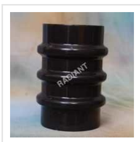
80kV Electric Insulator