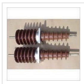
High Voltage Bushing