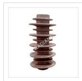
Load Breaker Switches Bushing