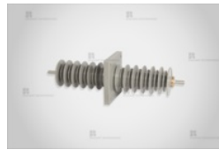
25 KV RAILWAY BUSHING