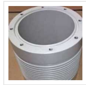
Alumina Filled Insulator