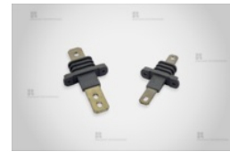
POLYMER CONCRETE BUSHINGS