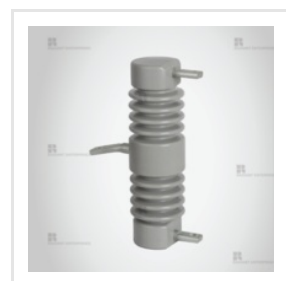
110 KV BIL Fuse Cut Out Insulator