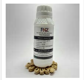
1 Kg Tin Powder