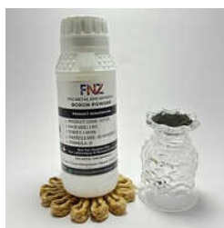
INDUSTRIAL BORON POWDER