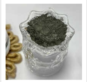
Boron Carbide Powder