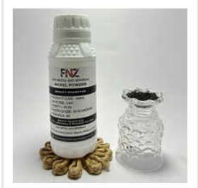
1 Kg Nickel Powder