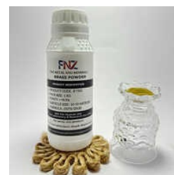
1 KG BRASS POWDER