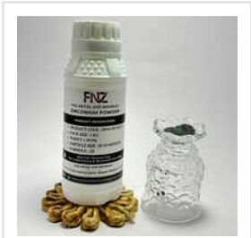
1 Kg Zirconium Powder