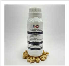
1 Kg Copper Powder