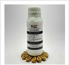
1 Kg Zinc Powder