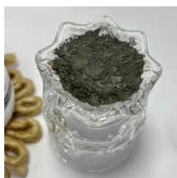
BORON CARBIDE POWDER

1 Kg Brass Powder, 1 Kg Copper Powder, 1 Kg Nickel Powder, 1 Kg Tantalum Powder, 1 Kg Tin Powder, 1 Kg Tungsten Powder, 1 Kg Zinc Powder, 1 Kg Zirconium Powder, Boron Carbide Powder, Industrial Boron Powder, etc.