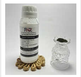
1 Kg Tantalum Powder