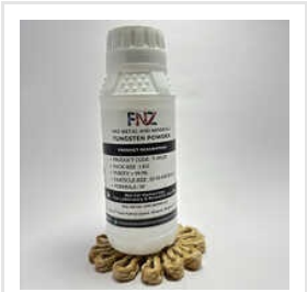
1 Kg Tungsten Powder