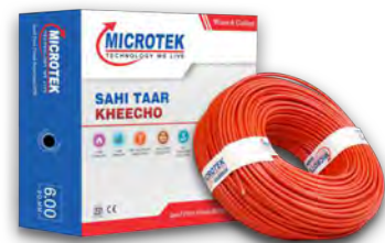
WIRES & CABLES