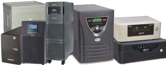
UPS | INVERTERS