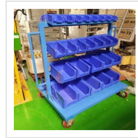
Bin Storage Rack And Trolley