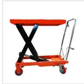
Scissor Lift Table Cum Trolley