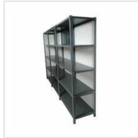
Slotted Angle Rack