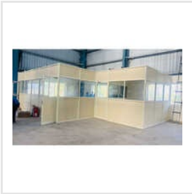
Aluminum Office Cabins