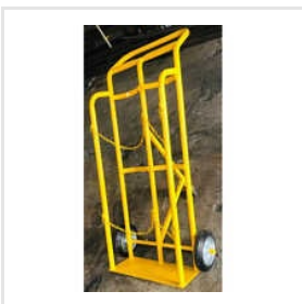
Gas Cylinder Handling Trolley