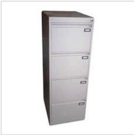
SS File Rack