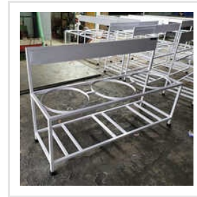
Dustbin Portable Stand