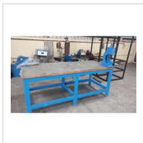
Maintenance Heavy Duty Metal Table