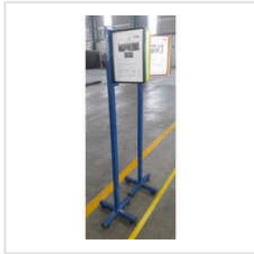
MS Display Stand