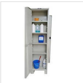
Industrial Storage Cabinet