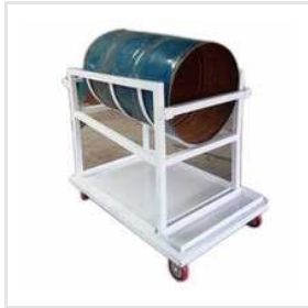
Drum Handling Trolley