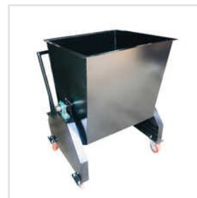
SS Chip Scrap Trolley