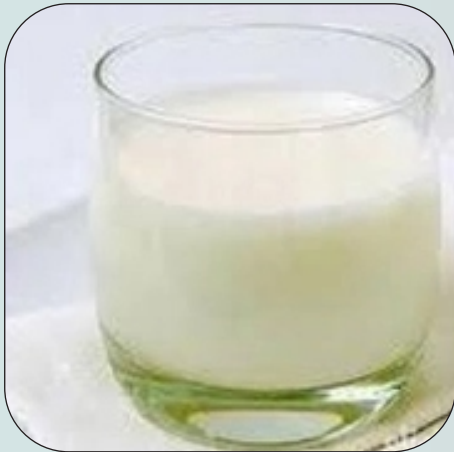
AAC Soluble Oil