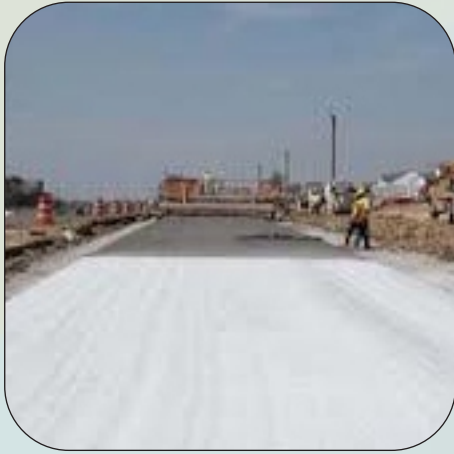
Wax Based Curing Compound