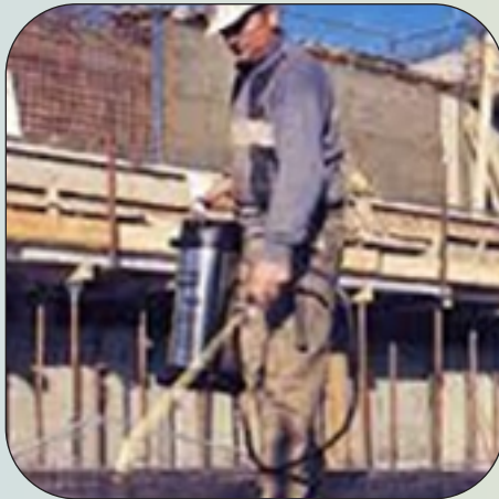
Shutter Release Oil