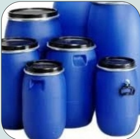
Mould Release Agent