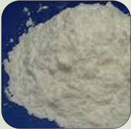
Powder Polycarboxylate Ether