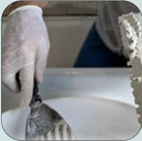
Methyl Hydroxyethyl Cellulose