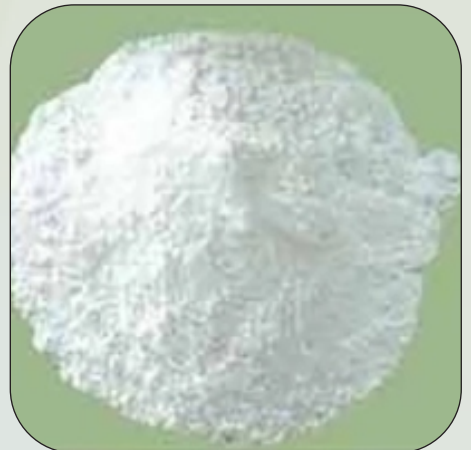
Sulfonated Melamine Formaldehyde