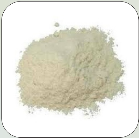
Concrete Polycarboxylate Ether