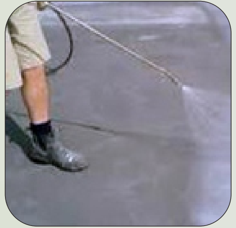
Concrete Curing Compound