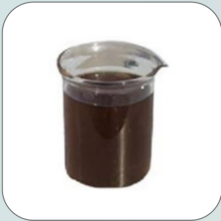
Liquid Polycarboxylate Ether