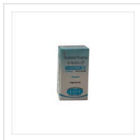
Fludarabine Phosphate For Injection USP