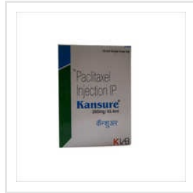
Paclitaxel Injection IP