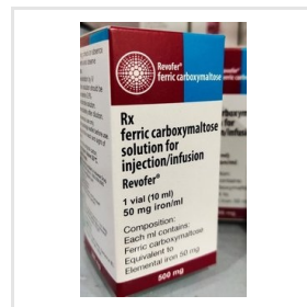
Revoer (Ferric Carboxymaltose)