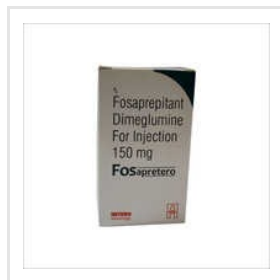
150mg Fosaprepitant Dimeglumine For Injection