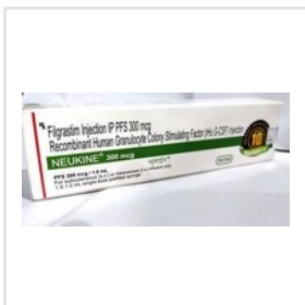
PFS 300mcg Filgrastim Injection IP