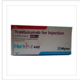
Trastuzumab For Injection