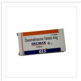
4mg Dexamethasone Tablets