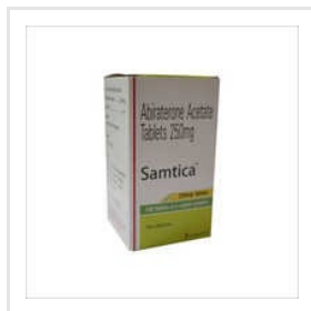
Abiraterone Acetate Tablets