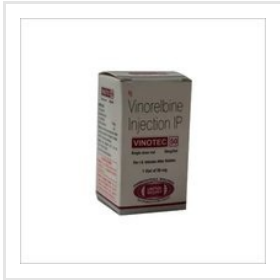
Vinorelbine Injection IP