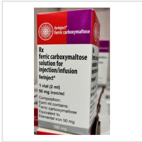
Ferinject (Ferric Carboxymaltose)