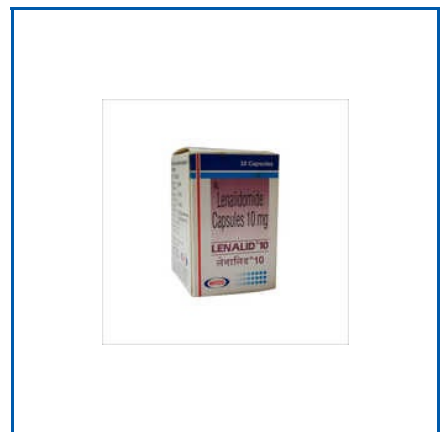
10MG LENALIDOMIDE CAPSULES