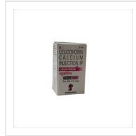
Leucovorin Calcium Injection IP