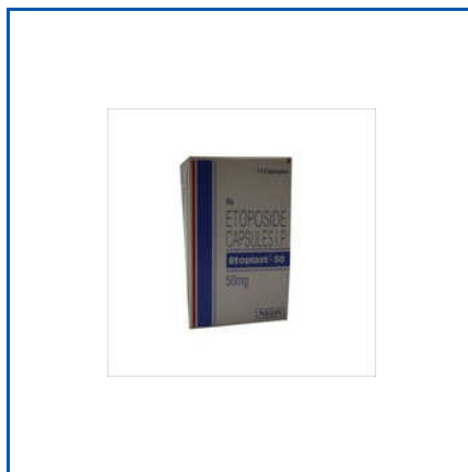
ETOPOSIDE CAPSULES IP