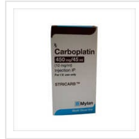
Carboplatin Injection IP