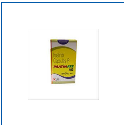
IMATINIB CAPSULES IP

10mg Lenalidomide Capsules, 150mg Fosaprepitant Dimeglumine For Injection, 160mg Megestrol Acetate Tablets IP, 20mg Tamoxifen Citrate Tablets IP, 2mg Bortezomib Injection IP, 40mg Megestrol Acetate Tablets IP, 450mg Kemocarb Injection, 4mg Dexamethasone Tablets, Abiraterone Acetate Tablets, Amoxicillin and Potassium Clavulanate Tablets IP, Antiseptic Liquid Hand Wash, Bethanechol Chloride Tablets USP, CORANA (Covid-19) Medicine, Carboplatin Injection IP, Corovir 100MG, etc.