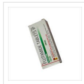
Flutamide Tablets IP