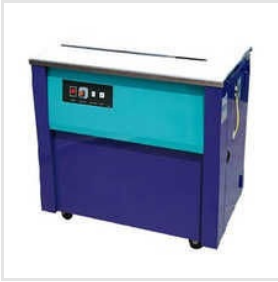
EXS-306 Semi-Automatic Strapping