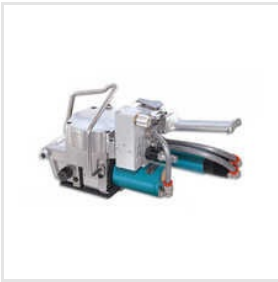
ITA-11 Pneumatic Strapping Tool