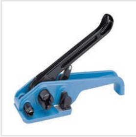
P-330 PP PET Cord Strapping Tensioner