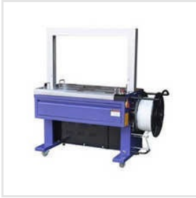
ET-80A Fully Automatic Strapping