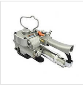
Handheld Pneumatic Strapping Tool