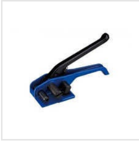
P-482 Tensioner Cord Strapping