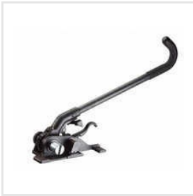
PH-350 Heavy Duty Windlass Tensioner For