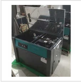
Supremo Box Strapping Machine