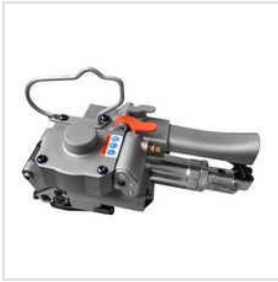
AQD-19 Pneumatic PET Strapping Tool