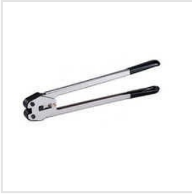
C-5005 High Quality PET Strapping Sealer