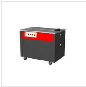
PW 316H Semi Automatic Strapping