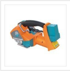
ITA-20 Battery Operated Strapping