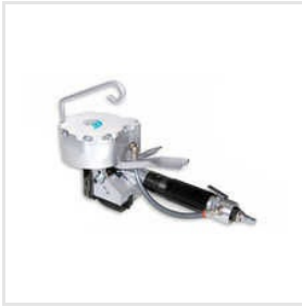
ITA-40 Pneumatic Strapping Tool