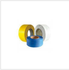
PP Plastic Box Strapping