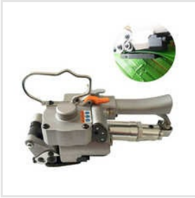
CA-19 Pneumatic Strapping Machine