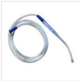
Yankauer Suction Set