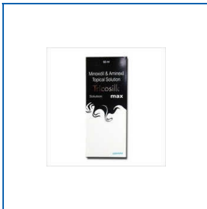
MINOXIDIL AND AMINEXIL TOPICAL SOLUTION

0.75mg Levonorgestrel Tablet, 100mg Lamivudine Tablet, 100mg Remicade, 200mg Progesterone Soft Gelatin Capsules, 20mg Rivaroxaban Film Coated Tablet, 250mg Abiraterone Acetate Tablet, 30gm Permethrin Cream, 3ml Docetaxel Injection I.P. Concentrate, 400mg Sofosbuvir Tablets, etc.