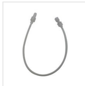
IV Extension Line