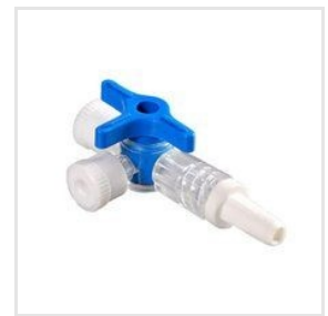
Three Way Stop Cock