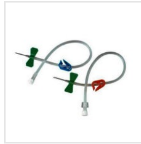
A.V. Fistula Needle