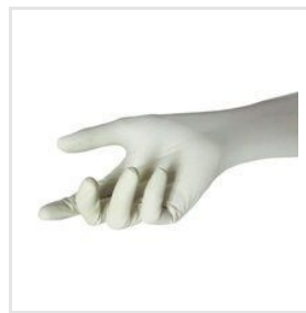
Latex Examination Gloves