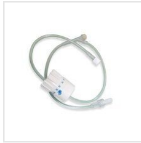
I.V. Flow Regulator