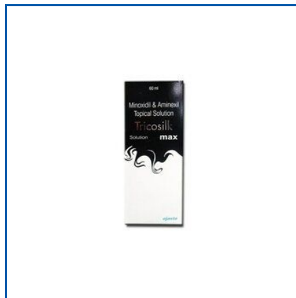
TRICOSILK MAX SOLUTION