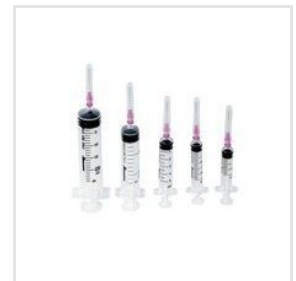
Plastic White Disposable Syringes