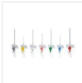
Plastic Safety IV Cannula For Clinical