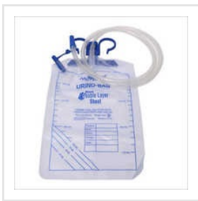
Urine Collecting Bag