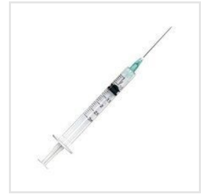
Plastic Auto Disable Syringe