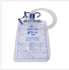
Urine Collecting Bag PVC