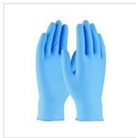
Nitrile Examination Gloves