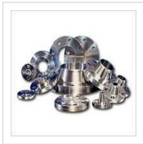
Stainless Steel Flanges