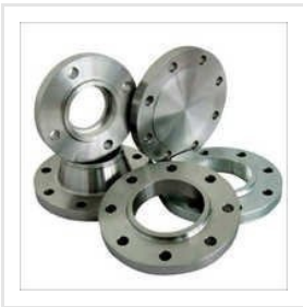
Socket Weld Flange