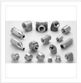
Socket Weld Pipe Fittings