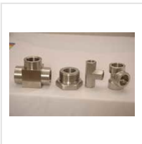
SS Pipe Fittings