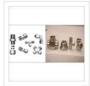
Tube And Pipe Fittings