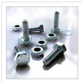
Metal Nuts Bolts