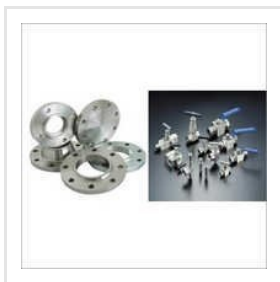
Steel Flanges And Industrial Valves