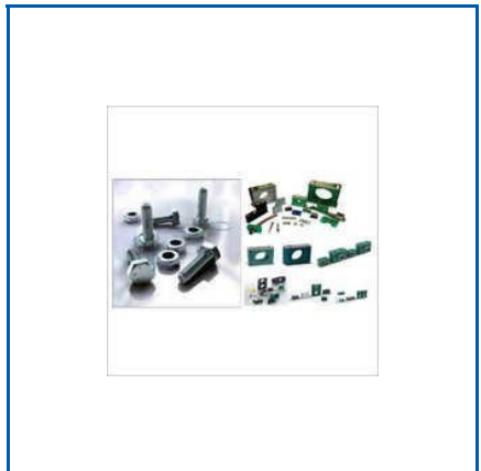
NUT BOLTS AND PIPE CLAMPS