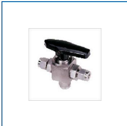
BALL VALVES – 3 WAY