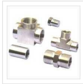
Steel Pipe Fittings