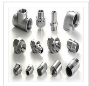
Screwed Pipe Fittings