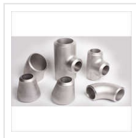
Butt Weld Pipe Fittings