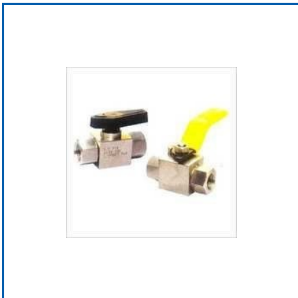
SS BALL VALVE

2 Way Manifold Valves, 3 Way Manifold Valves, 3 and 4 Way Ball Valve, 5 Way Manifold Valves, Accessories Gauges, Ball Valves – 3 Way, Brass Tube Fittings, Butt Weld Pipe Fittings, Butter Fly Valves, Butterfly Valve, Buttweld Fitting, Camlock Coupling, Chain Sprockets, Check Valves, Compression Tube Fitting, etc.