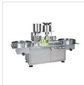
Automatic Injectable Powder Filling Cum