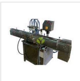
Automatic Linear Airjet And Vacuum Bottle