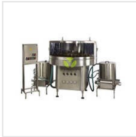
Semi-Automatic Rotary Washing