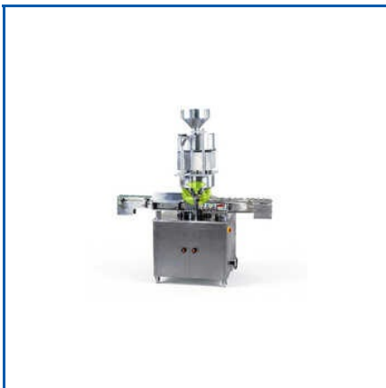
AUTOMATIC HIGH SPEED VIAL ALUMINUM CAP SEALING MACHINE

Automatic Air Cooled Induction Wad Sealing Machine, Automatic Augur Type Powder Filling Machine, Automatic Cap Assembling Machine, Automatic Cap Closing Machine, Automatic Double Side Self Adhesive Labeling Machine, Automatic Dual Head Augur Powder Filling Cum Dual Head Screw Capping Machine, Automatic Four Heads Augur Powder Filling Cum Double Heads Screw Capping Machine, Automatic High Speed Gearpump Liquid Filling Machine, etc.