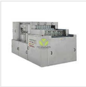
Automatic High Speed Linear Bottle - Vial