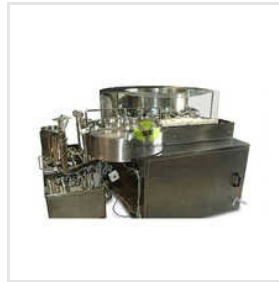
Gripper Type Automatic Rotary Vial