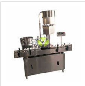
Automatic Single Head Inner Plug Pressing