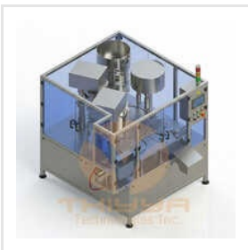
Automatic Four Heads Augur Powder Filling