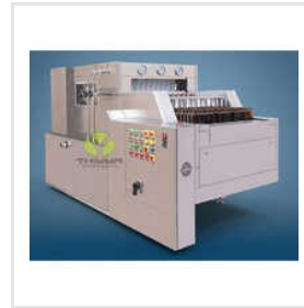
Automatic High Speed Linear Bottle Washing