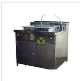
Multi-Jet Vial - Ampoule Washing