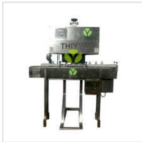
Automatic Air Cooled Induction Wad Sealing