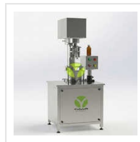
Semi - Automatic Single Head Ropp -