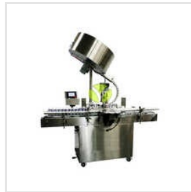
Heavy Duty Automatic Rotary-Linear Type