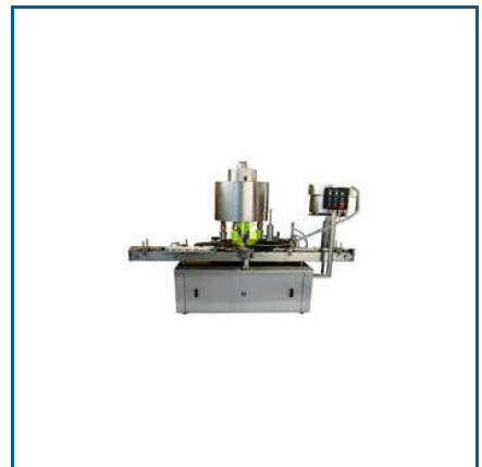
AUTOMATIC SCREW CAPPING MACHINE