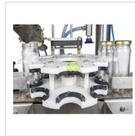
Automatic Single Head Rotary Lug Cap Sealing