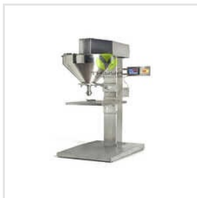
Semi Automatic Augur Type Powder Filling