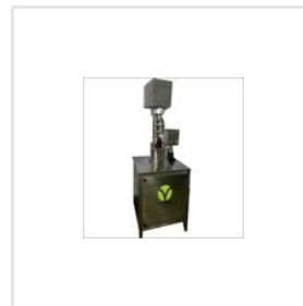
Screw Capping Machine