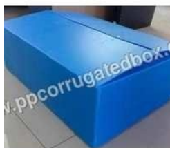
POLYPROPYLENE PLASTIC CORRUGATED BOXES