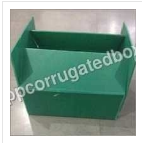
Polypropylene Crates & Bins