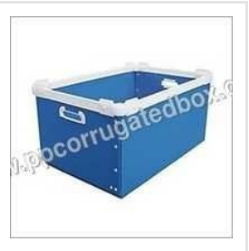
Polypropylene Plastic Corrugated Tray Boxes