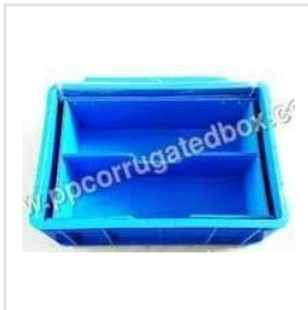
PP Storage Boxes