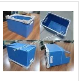
Multi Color PP Corrugated Box