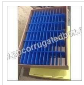
Partitioned Plastic Polypropylene