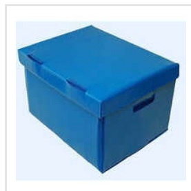
Top Bottom Box