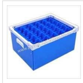
Plastic Packaging Boxes