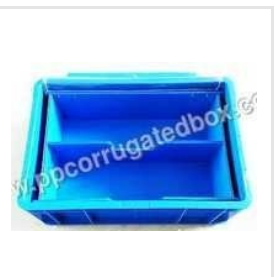
PP Corrugated Boxes