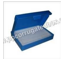
POLYPROPYLENE PLASTIC CORRUGATED DIE CUT BOXES