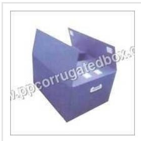
Corrugated Plastic Boxes