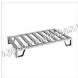
STAINLESS STEEL PALLETS

Corrugated Plastic Boxes, Honeycomb Partition, Multi Color PP Corrugated Box, Overlapping Box, PP Corrugated Boxes, PP Storage Boxes, PP Tray, Partitioned Plastic Polypropylene Corrugated Boxes, Plastic Packaging Boxes, Polypropylene Crates, Polypropylene Crates & Bins, Polypropylene Plastic Corrugated Boxes, Polypropylene Plastic Corrugated Die Cut Boxes, Polypropylene Plastic Corrugated Tray Boxes, Pp Fruit Boxes, etc.