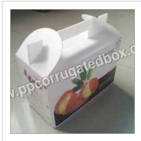
Pp Fruit Boxes