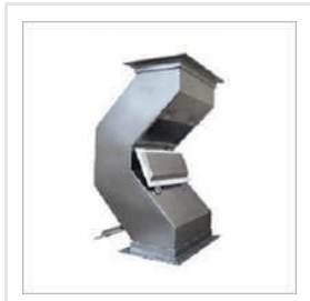
Hump Magnetic Separator