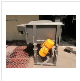
Motorized Vibrating Screen