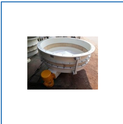
MOTORISED BIN ACTIVATOR

Bin Activator, Bin Vibrators, Circular Electro Magnet, Circular Vibratory Screen, Circular Vibro Sieve Separator, Compaction Table, Drawer Magnet, Electro Magnetic Ferro Filter, Grate Magnet, High Intensity Magnetic Roller System, Hopper Vibrator, Hopper Vibratory, Hump Magnet, Hump Magnetic Separator, Liquid Trap Magnet, etc.