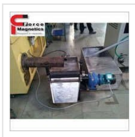
Magnetic Coolant Separator