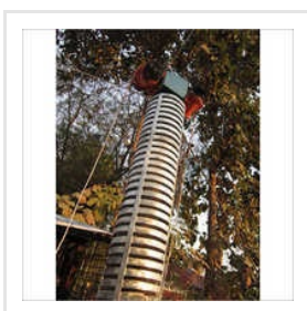
Unbalance Motorized Spiral Elevator