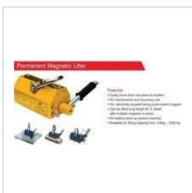
Permanent Magnetic Lifter