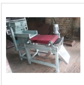
High Intensity Magnetic Roller