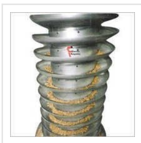
Motorized Spiral Elevator