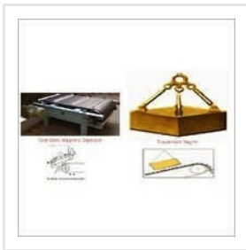
Over Band Magnetic Separator