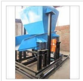
Vibratory Furnace Charger