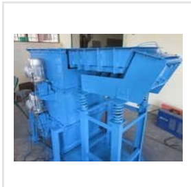
Magnetic Drum Separator