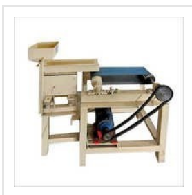
Magnetic Roll Separator