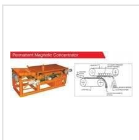
Permanent Magnetic Concentrator