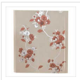
5mm Mould Wall Panel