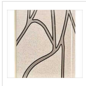
5mm X 250mm U Groove Panel