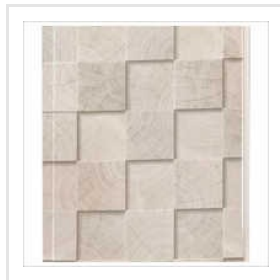
5mm Mould Door Panel