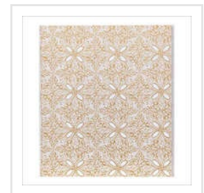
6mm X 250mm Without Groove Flat