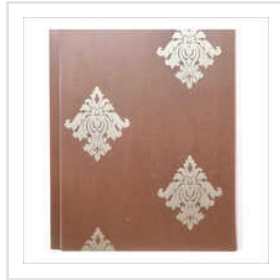
5mm Slim Mould Printed Panel