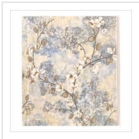
5mm Slim Mould Panel