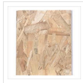
6mm X 250mm Without Groove Flat