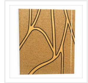
5mm X 250mm U Groove Wall Panel