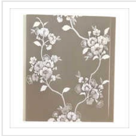
5mm Slim Mould Designer Panel