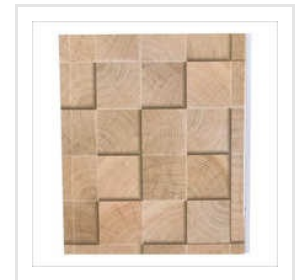
5mm Slim Mould Wooden Door Panel