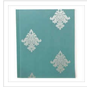
Slim Mould Wall Panel