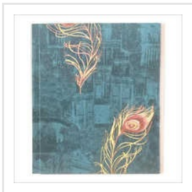
5mm Slim Mould Peacock Wall Panel