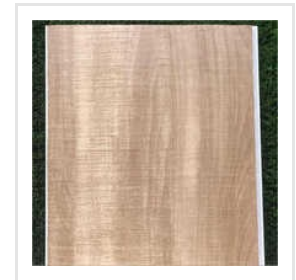
6mm X 250mm Without Groove Door