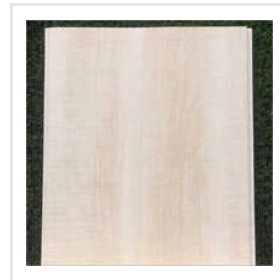
6mm X 250mm Without Groove Flat