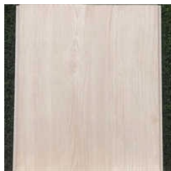
6MM X 250MM WITHOUT GROOVE FLAT DOOR PANEL

100% Waterproof Wooden Laminate Flooring, 5mm Mould Door Panel, 5mm Mould Printed Door Panel, 5mm Mould Wall Panel, 5mm Slim Mould Designer Panel, 5mm Slim Mould Panel, 5mm Slim Mould Peacock Wall Panel, 5mm Slim Mould Printed Panel, etc.