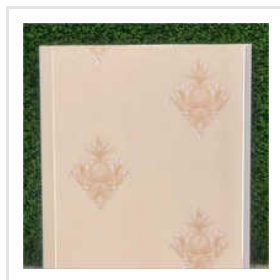
5mm Mould Printed Door Panel