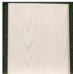
6MM X 250MM WITHOUT GROOVE FLAT PLAIN DOOR PANEL