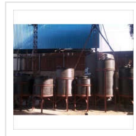
Industrial Spiral HDPE Holding Tank