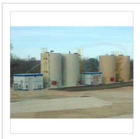
HDPE Acid Storage Tank