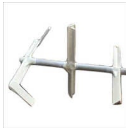
FRP CHEMICAL STIRRER