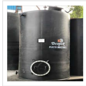
Vertical Spiral HDPE Storage Tank