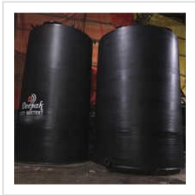
HDPE Chemical Storage Tank