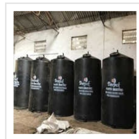
Industrial Spiral HDPE Vertical Storage Tank