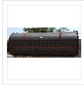
Spiral HDPE Chemical Storage Tank