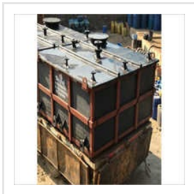
Industrial Spiral HDPE Rectangular Storage