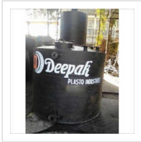
Spiral Storage Tank