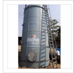
Vertical FRP Storage Tank