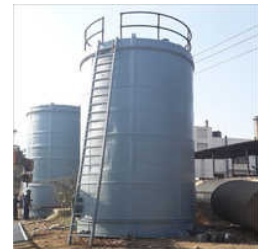
INDUSTRIAL FRP STORAGE TANK