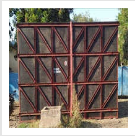
Industrial Square Spiral HDPE Storage