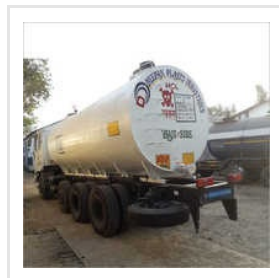
Spiral HDPE Lined Transportation Tanker