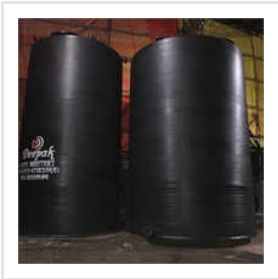
Spiral HDPE Storage Tank