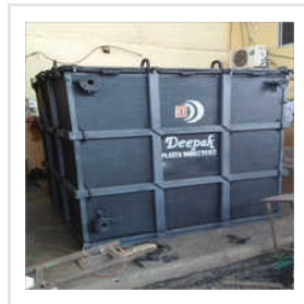
Spiral HDPE Rectangular Tank