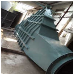
VERTICAL PP AND FRP SOLID TRAP

50 KL Chemical Storage Tank, Aluminum Storage Tank, Black Spiral HDPE Storage Tank, FRP Belt Chemical Blower, FRP Belt Drive Blower, FRP Chemical Stirrer, FRP Industrial Blower, HDPE Acid Storage Tank, HDPE Blower, HDPE Chemical Blower, HDPE Chemical Storage Tank, HDPE Vessel, Industrial Blower, Industrial FRP Storage Tank, Industrial PP / FRP Reactor, etc.