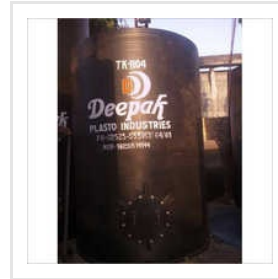
Black Spiral HDPE Storage Tank