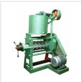
Oil Processing Machinery