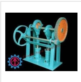
Oil Filter Press Pump