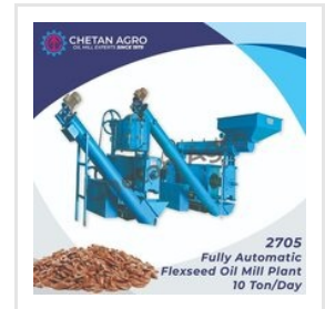
Fully Automatic Flexseed Oil Mill Plant