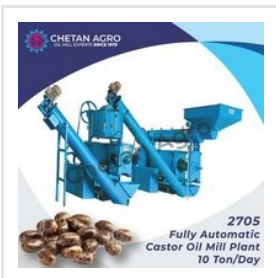
Fully Automatic Castor Oil Mill Plant Chetan