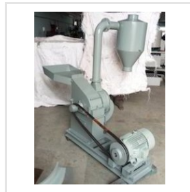
Spice Pulveriser With Cyclone Blower