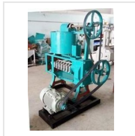
Oil Milling Plant