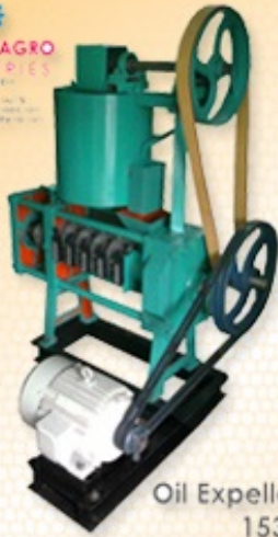
Oil Expeller 1535

The Complete House of Oil Mill Machinery, Food Processing Equipments & Seed Cleaning Machinery