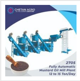
Fully Automatic Mustard Oil Mill Plant