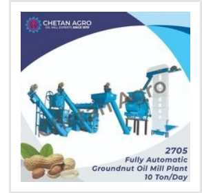
Groundnut Fully Automatic Oil Mill Plant