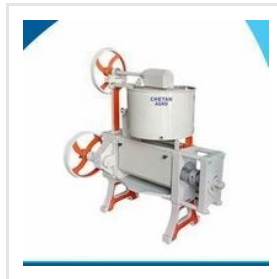
Oil Extraction Machine