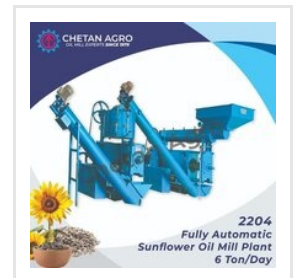
Sunflower Fully Automatic Oil Mill Plant