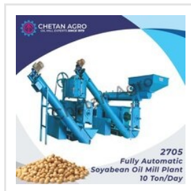
Fully Automatic Soyabean Oil Mill Plant