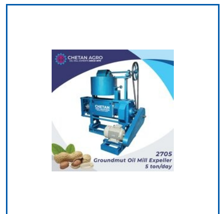
GROUNDNUT OIL MILL PLANT CHETAN AGRO OIL EXPELLER CAPACITY 5 TON/DAY