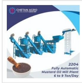
Fully Automatic Mustard Oil Mill Plant