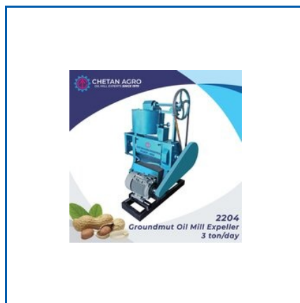
GROUNDNUT OIL MILL PLANT CHETAN AGRO OIL EXPELLER CAPACITY 3 TON/DAY