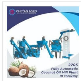
Fully Automatic Coconut Oil Mill Plant