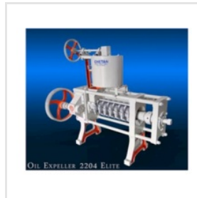
Mustard Oil Mill Machinery