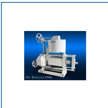
AUTOMATIC OIL MILL PLANT

Automatic Oil Mill Plant, Baby Boiler, Big Oil Pump, Castor Oil Mill Plant Chetan Agro Oil Expeller Capacity 150-200 kg/hour, Coconut Cutter, Coconut Mini Oil Mill Plant Chetan Agro Expeller Capacity 30 kg/hour, Coconut Oil Expeller, Coconut Oil Expeller Machine, Coconut Oil Mill Plant Chetan Agro Oil Expeller Capacity 100-125 kg/hour, Coconut Oil Mill Plant Chetan Agro Oil Expeller Capacity 150-200 kg/hour, etc.