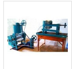
Mini Oil Expeller 1535 With Filter Press