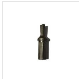
Aluminium U Drill Bit