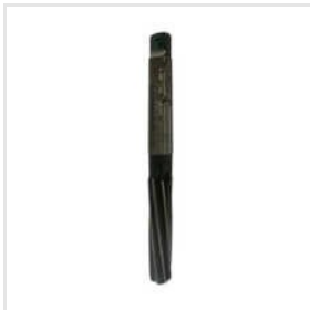
Spiral Fluted Machine Reamer