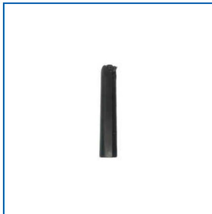
HARD ALLOY BORING INSERT HOLDER