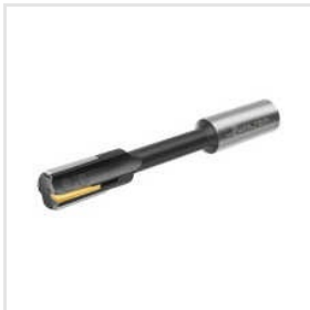
Sold Steel Machine Reamer