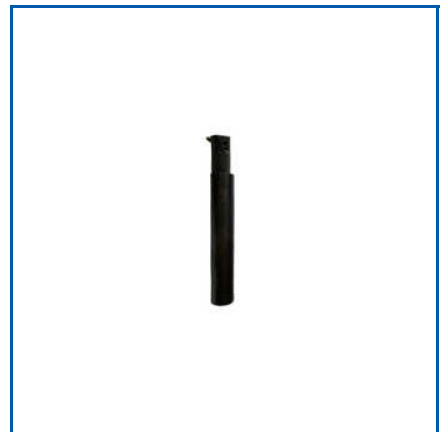
HARD ALLOY GROOVING TOOL HOLDER