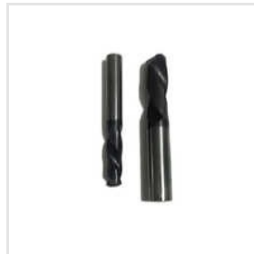
Carbide Brazed Cutting Tool