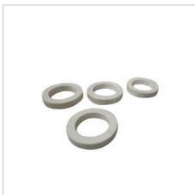
Ceramic Pump Plunger