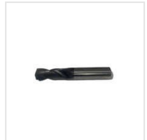
Milling Cutter Holder