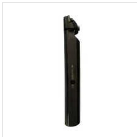
Industrial Grooving Tool Holder