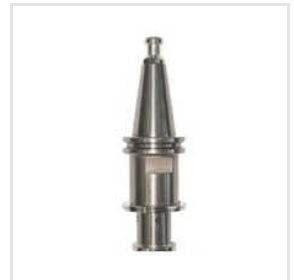
Hard Alloy CNC Tool Holder