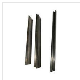
SS Tungsten Carbide Cutting Blade