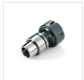
CNC Tool Holder