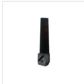
Hard Alloy CNC Turning Tool Holder