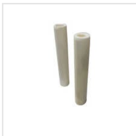
24mm Ceramic Pump Plunger