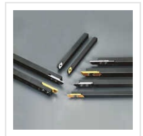
4 Inch Carbide Precision Drill Bit