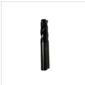
Carbide Precision Drill Bit