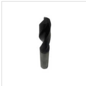
Carbide Cutting Tool