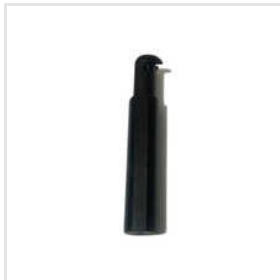
Steel Machine Reamer