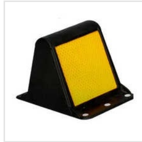
Median Road Marker