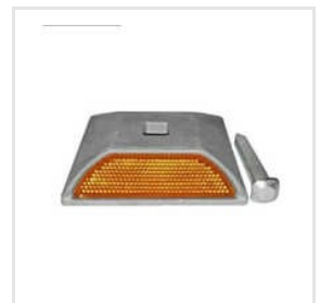
Aluminum Road Studs