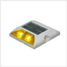
Solar Road Stud