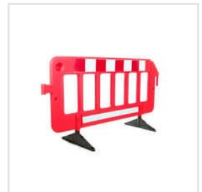
Road Barrier Fence