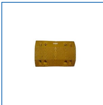
PLASTIC SPEED BREAKERS