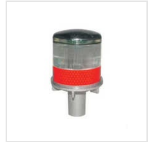
Solar Road Delineator