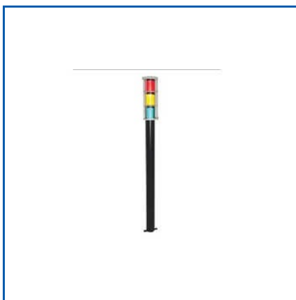
MS DELINEATOR POST

Aluminum Backed Flexible Reflective Tape, Aluminum Road Studs, Anti Skid Tape, Automatic Electric Boom Barrier, Caution Sign Board, Cautionary Sign Board, Conspicuity Tape, Cotton Workshop Uniform, Danger Sign Board, Display Sign Board, Electrical Sign Board, First Aid Box Sign Board, Flexible Spring Post, Floor Marking Tape, HDPE Safety Helmets, etc.