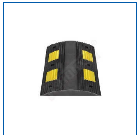
RUBBER SPEED BREAKERS