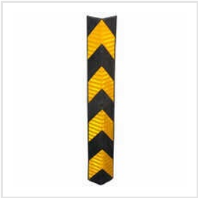
Rubber Corner Guard