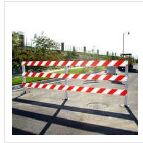
MS Road Barricades