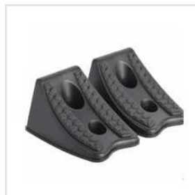
Rubber Car Stopper