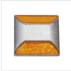
Road Delineator Stud