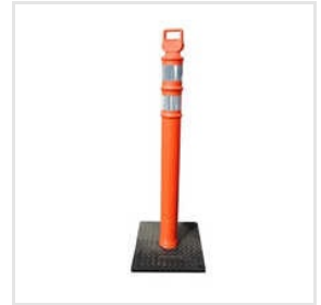
Plastic Road Delineator Post