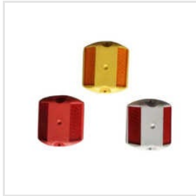
Road Studs And Cat Eyes