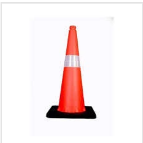
Red Plastic Traffic Cones