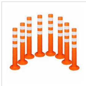
Flexible Spring Post Cones