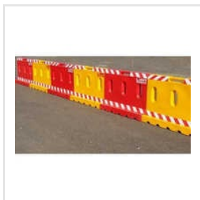
Road Traffic Barricades