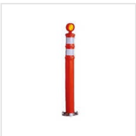
Road Delineator Post