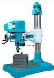
All Geared Fine Feed Radial Drilling