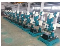
AUTOFEED RADIAL DRILL MACHINE