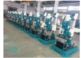
Autofeed Radial Drill Machine