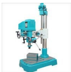
BACK GEARED FINE FEED RADIAL DRILLING MACHINES

25 mm Cap Back Geared Fine Feed Pillar Drill Machine, 40 mm All Geared Auto Feed Radial Drilling Machines, 50mm All Geared Radial Drill Machine, All Geared Auto Feed Pillar Drilling Machines, All Geared Fine Feed Radial Drilling Machines, Auto Feed Pillar Drilling Machines, Autofeed Radial Drill Machine, etc.