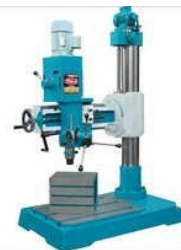
Radial Drill Machine