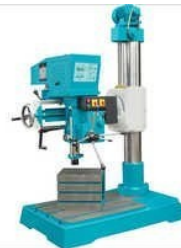
Heavy Duty Radial Drill Machines