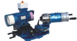
Drill Grinding Machine