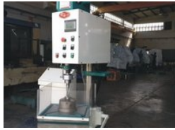
NC Servo Automatic Drilling Machines