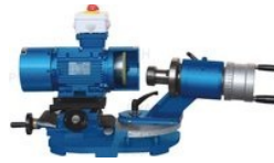
Drill Point Grinder