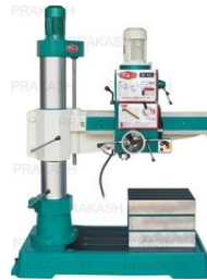
Double Column Radial Drill Machine