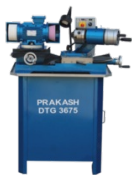
Drill Tap End Mill Grinder