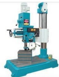
40 Mm All Geared Auto Feed Radial Drilling