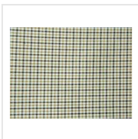
Polyester Cotton Pocketing Fabric