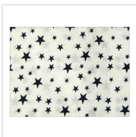
Cotton Pocketing Fabric