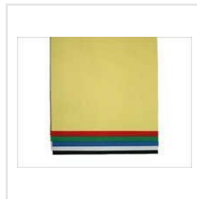
Plain Pocketing Fabrics