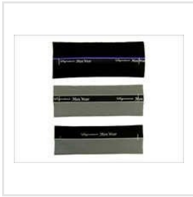
Printed Twill Tape