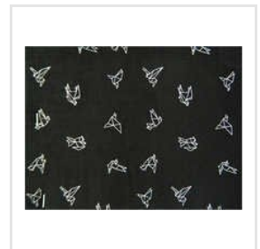
Design Pocketing Fabrics