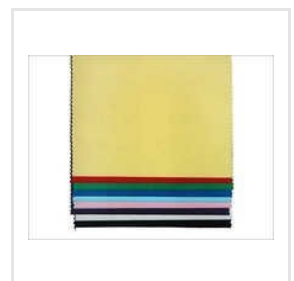
Plain Color Pocketing Fabrics