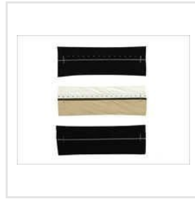
Fabrics Piping Tapes