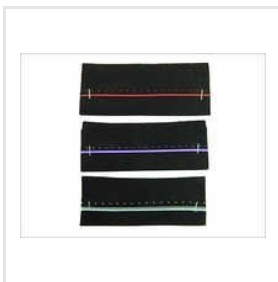
Wrights Twill Tape