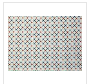
Fashion Pocketing Fabrics