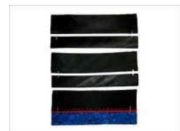
COTTON PIPING CORD