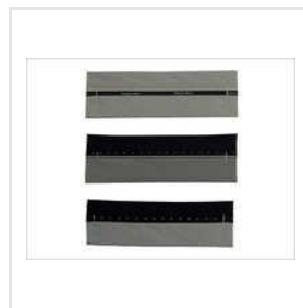
Pocketing Piping Tape