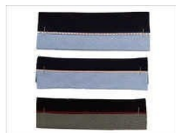
DESIGNER COTTON TAPE