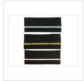
Narrow Twill Tapes