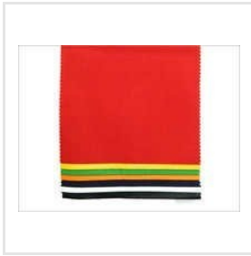
Colour Pocketing Fabrics