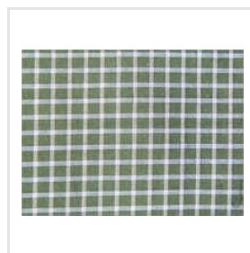
Pocket Cloth Fabric