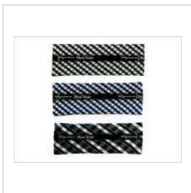
Cotton Twill Tape