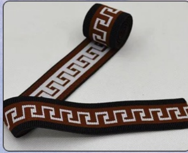
Woven Jacquard Elastic