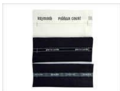
COTTON CLOTH TAPES

jacquard tapes, Garment Gross Grain Tapes, Gross Garment Tapes, Gross Grain Garment Tape, Gross Grain Tapes, Interlining Grain Tapes, Multi Color Gross Grain Tapes, Polyester gross grain tapes, Polyester gross grain tape, Trouser Interlining Band, Trouser Waist Bands, Trouser's Waistbands, Twill Tapes, belts, cotton tapes, etc.