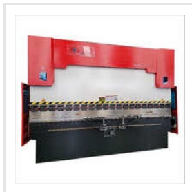
Industrial CNC Bending Machine