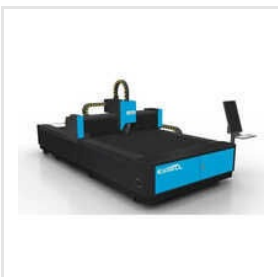
Metal Steel Copper Brass Fiber Laser