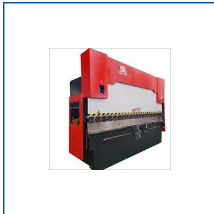
AUTOMATIC CNC BENDING MACHINE