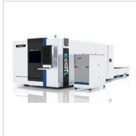
Fiber Laser Cutting Machine With