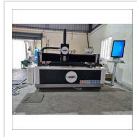
Fiber Laser Cutting Machine Single Table