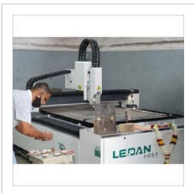
Automatic Fiber Laser Cutting Machine