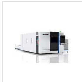
DOUBLE TABLE FIBER LASER CUTTING