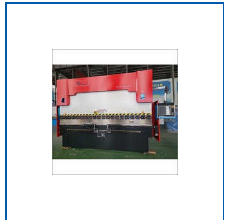
NC BENDING MACHINE