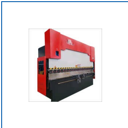
MILD STEEL CNC BENDING MACHINE

20w Laser Marking Machine, 3D Laser Engraving Machine, 3D Laser Marking Machine, Automatic CNC Bending Machine, Automatic CNC Fiber Laser Cutting Machines, For Industrial, Automatic Exchange Table Laser Cutting Machine, Automatic Fiber Laser Cutting Machine, etc.