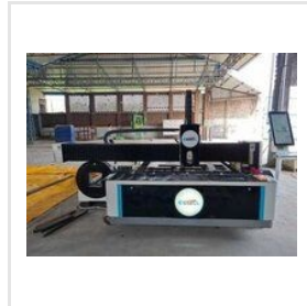
Pipe Laser Cutting Machine