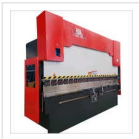
CNC Plate Bending Machine