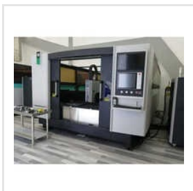
Stainless Steel Fiber Laser Cutting Machine