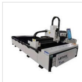
Ledan Fiber Laser Cutting Machine