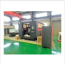
Mild Steel Exchange Table Fiber Laser