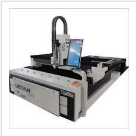
Fiber Laser Cutting Machine