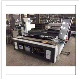
Single Table Fiber Laser Cutting Machine