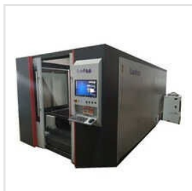
FIBER LASER CUTTING MACHINE WITH