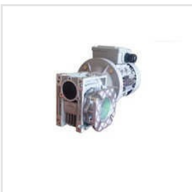
Industrial Worm Geared Motor