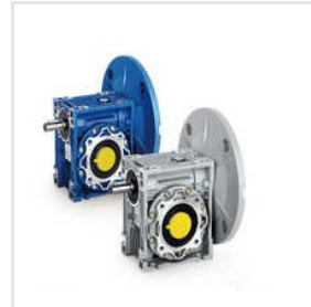
Inline Gear Motor