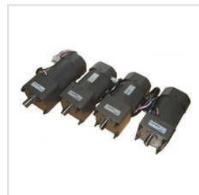
Three Phase Gear Motor