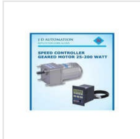
90 Watt Ac Geared Motor