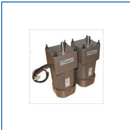
AC GEARED MOTORS

0.25 HP Helical Geared Motor, 0.37KW 3PHASE HELICAL GEARED MOTOR, 120W PMDC Motor, 150W Geared Motor, 15W FHP Geared Motor, 15W Speed Controller Helical Motor, 15W Speed Controller Motor, 180W Electromagnetic Brake Motor, 180W FHP AC Geared Motor, 180W Geared Motor, 2 Hp Industrial Pmdc Motor, 200 Watt AC Geared Motor, 200 Watt FHP Geared Motor, 200 Watt Speed Controlled Geared Motors, 25W FHP Geared Motor, etc.