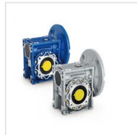
Three Phase Electric Gear Motor