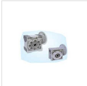
200 Watt AC Geared Motor