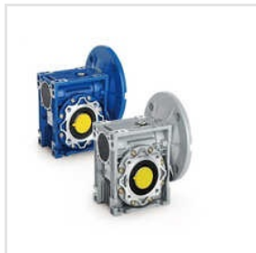
Three Phase AC Geared Motor