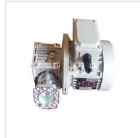
Worm Geared Motor