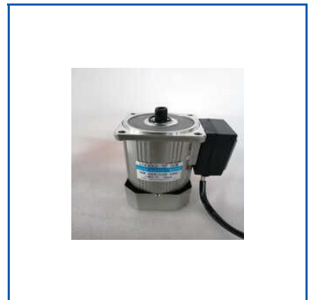
AC INLINE GEAR MOTOR