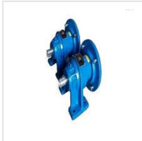
Planetary Gear Motor