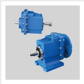
0.37KW 3PHASE HELICAL GEARED