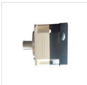
Gear Head Motor