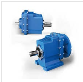
Three Phase Industrial Gear Motor