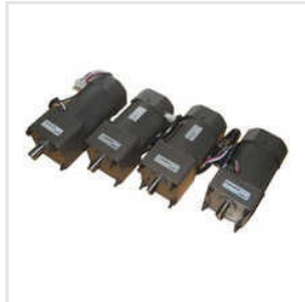
0.25 HP Helical Geared Motor