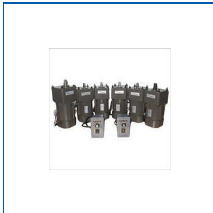
COMPACT GEARED MOTORS