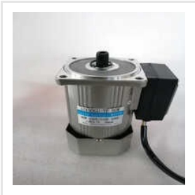
6W AC Geared Motor