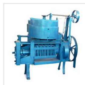
Peanut Oil Extraction Machine