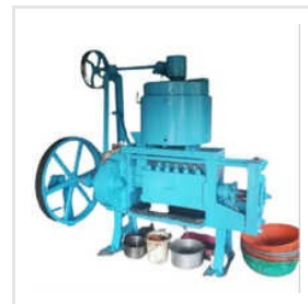
Neem Oil Mill