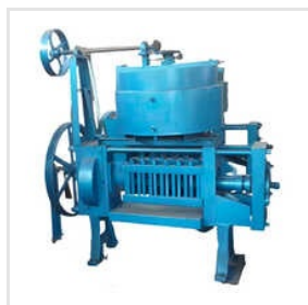
Cooking Oil Extraction Machine