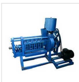
Cold Press Oil Machine