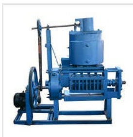
5 HP Oil Extraction Machine