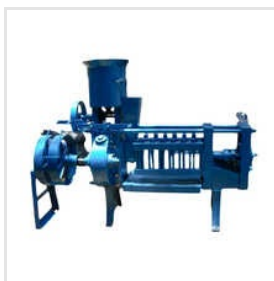
Mustard Oil Extraction Machine