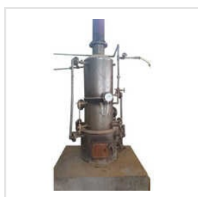
Oil Mill Plant