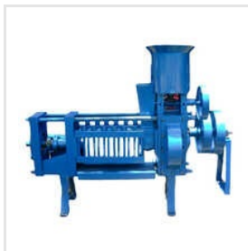
Oil Mill Machinery