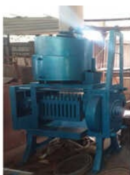
WATER COOLING ARRANGEMENT OIL EXPELLER

10 HP Red Chilli Grinding Machine, 4 Bolt Oil Expeller, 5 HP Oil Extraction Machine, 9 Bolt Oil Expeller, Automatic Wheat Cleaning Plant, Automatic Wheat Destoner, Avala Supari Cutter Machine, Blower Type Pulverizer, Box Type Pulverizer, Chaff Cutter Machine, Chilli Grinding Machine, Coconut Oil Extraction Machine, Cold Press Oil Machine, Cooking Oil Extraction Machine, Destoner Without Aspiration, etc.