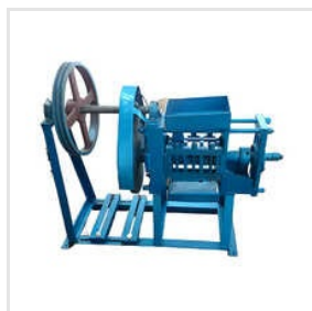
Small Oil Expeller