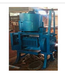
Oil Mill For Neem