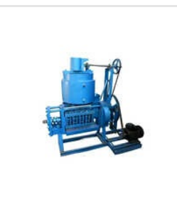
Sunflower Oil Press Machine