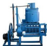
4 BOLT OIL EXPELLER