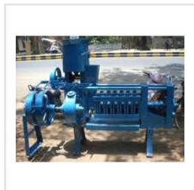
Oil Expeller Machine