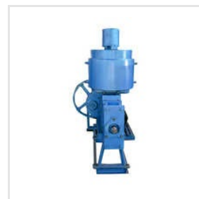
Mustard Oil Mill