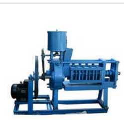
Oil Expellers Machine