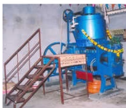
9 Bolt Oil Expeller