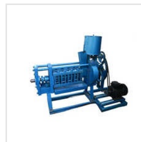
Coconut Oil Extraction Machine