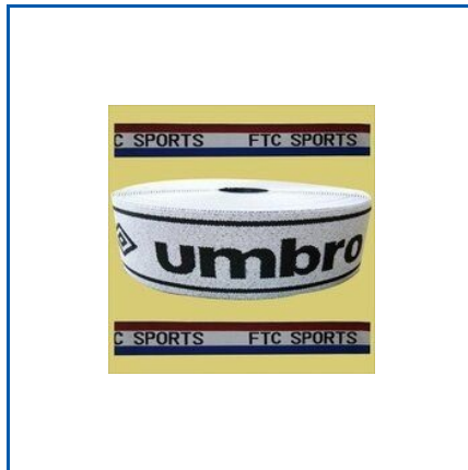
GARMENTS NAME TAPES