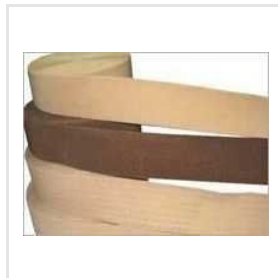
Surgical Elastic Tapes