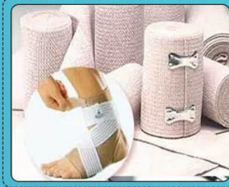
SURGICAL BELT ELASTICS