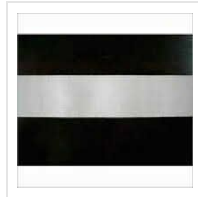
Knitted Elastic Tapes