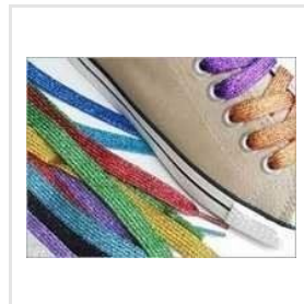
Shoe Elastic Tapes