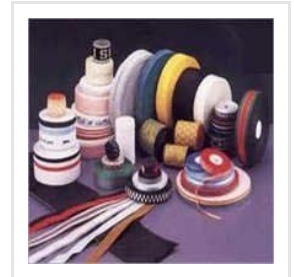
Crochet Elastic Tapes