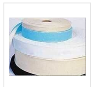
Garments Plain Tapes