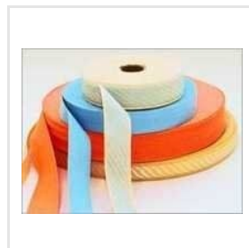
Plain Elastic Tapes