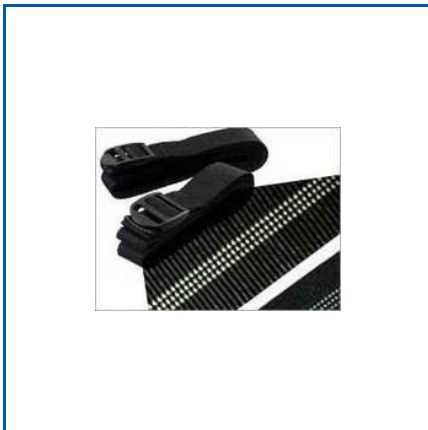
LUGGAGE ELASTIC TAPES

Buttonhole Elastic, Crochet Elastic Tapes, Crochet Elastics, Curtain Tapes, Frill Elastics, Furniture Tapes, Garments Name Tapes, Garments Plain Tapes, Jacquard Elastic Tapes, Knitted Elastic Tapes, Luggage Elastic Tapes, Luggage Elastics, Mask Elastics, Plain Elastic Tapes, Shoe Elastic Tapes, etc.