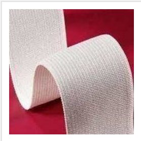
Woven Elastic Tape