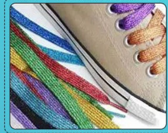
SHOE ELASTIC TAPES

Buttonhole Elastic, Crochet Elastic Tapes, Crochet Elastics, Curtain Tapes, Frill Elastics, Furniture Tapes, Garments Name Tapes, Garments Plain Tapes, Jacquard Elastic Tapes, Knitted Elastic Tapes, Luggage Elastic Tapes, Luggage Elastics, Mask Elastics, Plain Elastic Tapes, Shoe Elastic Tapes, etc.