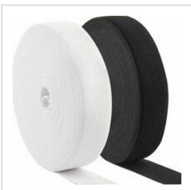
Spandex Lycra Elastic