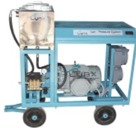
Water Blasting Machines