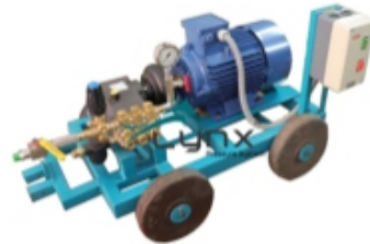
Hawk High Pressure Plunger Pumps