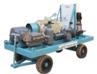
Ultra High Pressure Hydro Blaster