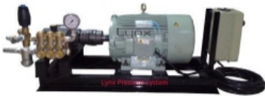
Triplex Piston Plunger Pump