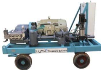
High Pressure Water Blasting Machine