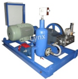
High Pressure Cleaners Triplex Pump