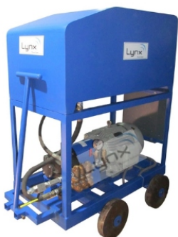
Electric Pressure Testing Pumps & Machines