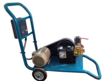
Hydro Testing Pump