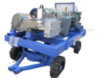
High Pressure Water Blasting Pump