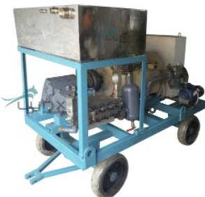
High Pressure Hydro Jet Blasting Machine