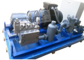
Industrial Triplex Pump