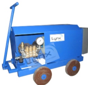
Water Jet Blasting Machines