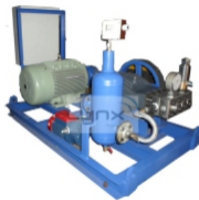
Electric Hydrostatic Pressure Test Pump