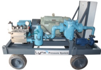
Water Blasting Cleaning Machines