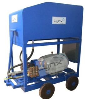
Reciprocating Plunger Pumps