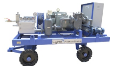
Diesel operated Hydro Blasting Machines