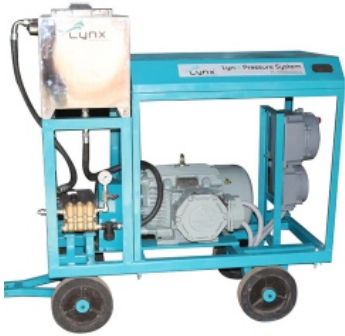
Triplex Plunger Machines