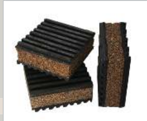
Anti Vibration Cork Pads are used in Conveyors, Compressors, Air Conditioning Plants, Refrigeration Plants, Generators, Pumps, Motors Etc.