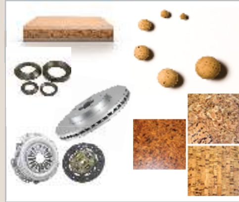
Plain Cork Sheets are used in Gasket, Clutch Liners, Cork balls, Decorative Tiles, Display boards, Insulating & Sound Proffing system for runways & Other Gift Articales.