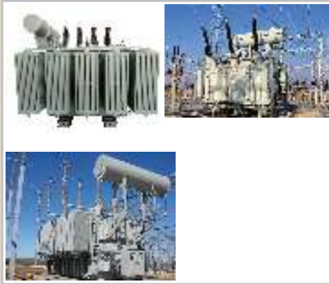
Rubberized Cork Sheet are used in Transformer Industries.