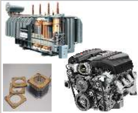
Rubberized Cork Gaskets are used in a wide range of industries like Automotive, railroad, Tracctor, Ship, Transformers, Electrical Equipments Etc.