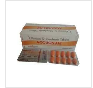
Ofloxacin & Ornidazole