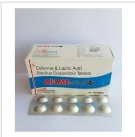
Cefixime & Lactic Acid Bacillus Dispersible