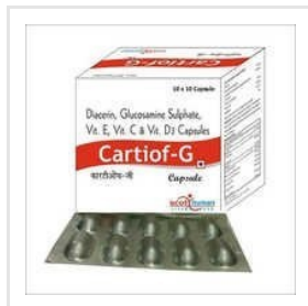
Diacerin & Gulcosamine Sulphate