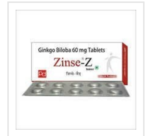
Ginkgo Biloba 60MG Tablet