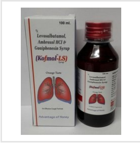
Levosulbutamol 1mg, Ambroxol 30mg &