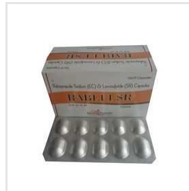
Rabprazole Sodium & Levosulpride