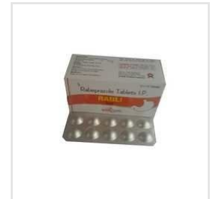
Rabprazole 20 Mg Alu Alu