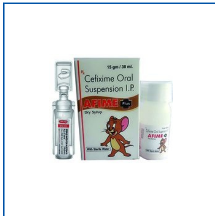
AFIME PLUS DRY SYP