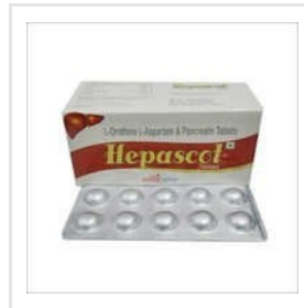
L-Ornithine L-Aspartate 150 Mg