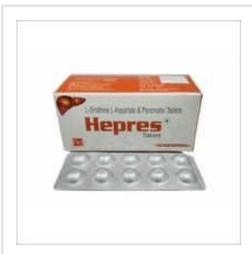
L-Ornithine L-Aspartate 150 Mg