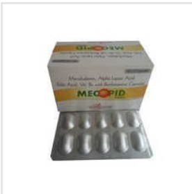
Mecobalamin Alpha Lipoic Acid