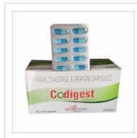
Fungal Diastase And Pepsin Capsules