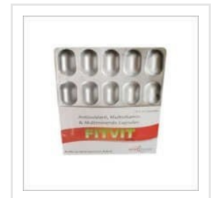
Anti Oxidant, Multi Vitamin, Multimineral