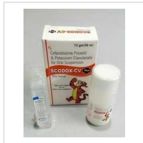
Cefpodoxime And Clavulanate Acid