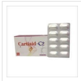
Glucosamine, Collagen, Chondroin,