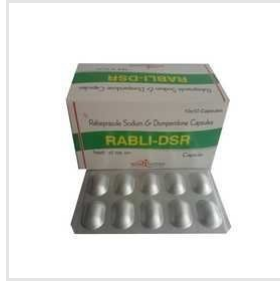
Rabprazole Sodium & Domperidone