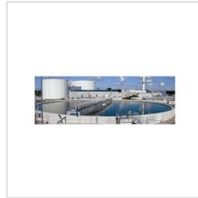
Industrial STP Plant