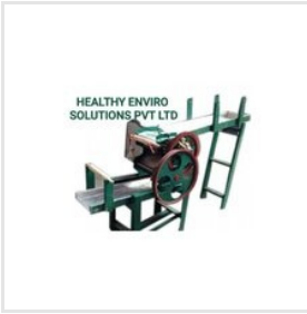
Semi Automatic Noodle Making