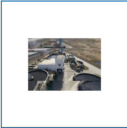
INDUSTRIAL ETP PLANT

10 Roller Automatic Noodles Making Machine, 14 Roller Automatic Noodles Making Machine, 20 Roller Automatic Noodles Making Machine, etc.