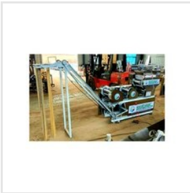
10 Roller Automatic Noodles Making