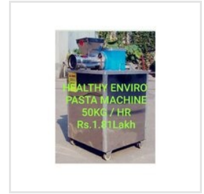
30-50 Kg/Hr Automatic Pasta Making Machine