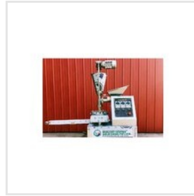
Automatic Momo Making Machine