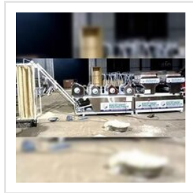
20 Roller Automatic Noodles Making