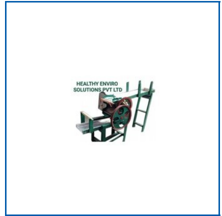
SEMI AUTOMATIC NOODLE MAKING MACHINE