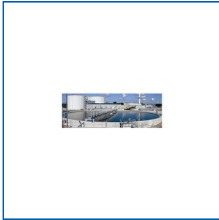
INDUSTRIAL STP PLANT