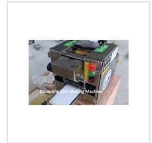
Automatic Momo Samosa Sheet Making