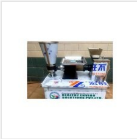
Automatic Samosa Making Machine