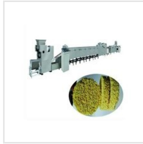
Instant Noodles Making Machine