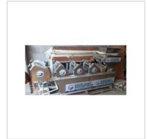
14 Roller Automatic Noodles Making