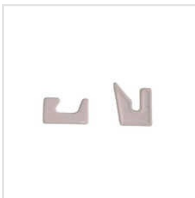
Ceramic V And G Type Guide