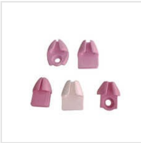
Alumina Ceramic Spinning Head Yarn