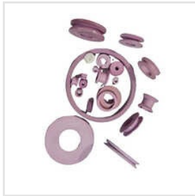
High Alumina Ceramic Pulley