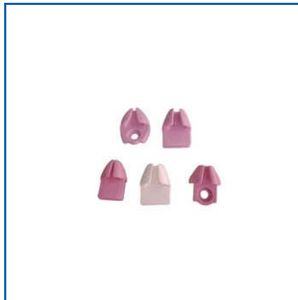
ALUMINA CERAMIC SPINNING HEAD YARN GUIDE