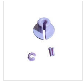
Ceramic Cut Eyelet