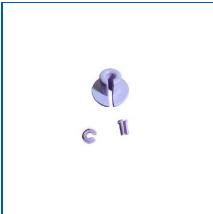
CERAMIC CUT EYELET

Alumina Ceramic Spinning Head Yarn Guide, Ceramic Aluminum Valve, Ceramic Cut Eyelet, Ceramic V And G Type Guide, High Alumina Ceramic Pulley, etc.