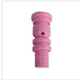
Ceramic Aluminum Valve