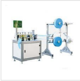
Automatic Cup Mask Covering Piece Making