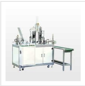
Ultrasonic Outside Ear-Loop Welding Machine