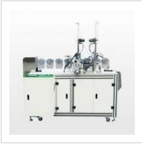
Automatic Folded Mask Ear Loop Welding