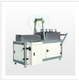
Automatic Ultrasonic Tie-On Mask Ear-Loop