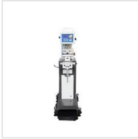
Cup Mask Pad Printer Two Colors