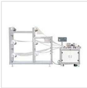
Clam Type Mask Blank Machine/C Shape