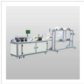
Fish Type Mask Machine