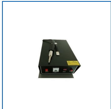
28KHZ ULTRASONIC HAND WELDER