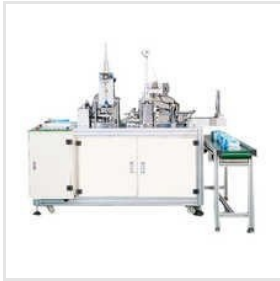
Inner Ear-Loop Face Mask Machine