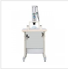
Cup Face Mask Breathing Valve