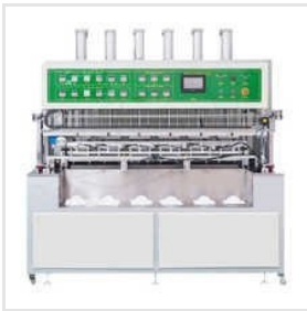
Auto Cup Mask Forming Machine