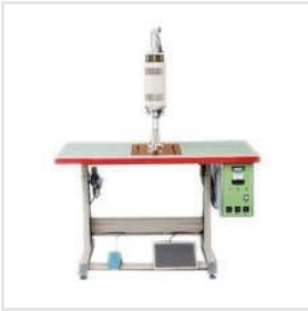
Face Mask Ear Loop Welding Machine