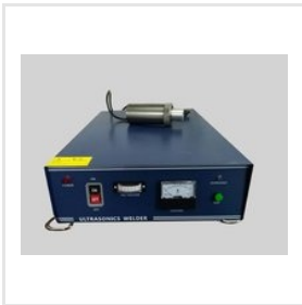
20 KHz Ultrasonic Hand Welder