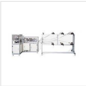
Automatic Ultrasonic Duckbill Mask Blank