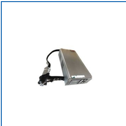
ULTRASONIC HAND GUN WELDER

20 kHz Ultrasonic Hand Welder, 20 kHz Ultrasonic Welding Transducer, 2000watt-3000watt Plastic Welding Machine Digital one Model, 28Khz Ultrasonic Hand Welder, 40Khz Ultrasonic Hand Welder, 8-Inch Ultrasonic Lace Machine, Auto Computer Control Rhinestone Hot Fix Machine, Auto Cup Mask Forming Machine, Auto Elastic Cutting Machine, Auto Hot Plate Plastic Pallet Welding Machine, Auto Rotary Ultrasonic Welding-Machine (20KHZ) (2000w), Automatic Cotton Filter Punching Machine, Automatic Cup Mask Covering Piece Making Machine, Automatic Folded Mask Ear Loop Welding Machine, Automatic Medical Mask Making Machine, etc.