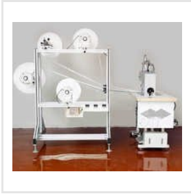
Ultrasonic Semi-Auto Dust Mask Machine