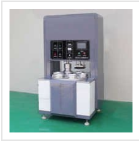
Auto Rotary Ultrasonic Welding-Machine