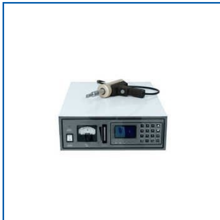
ULTRASONIC SPOT WELDING MACHINE